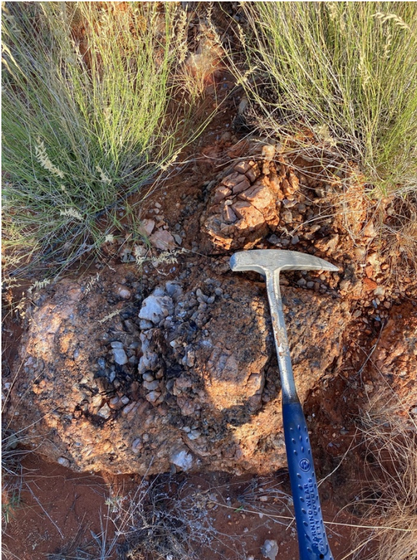
Figure 5: Pegmatite outcrop with tourmaline and flaky mica.

ASX Announcement | ASX: A8G | 29 March 2022