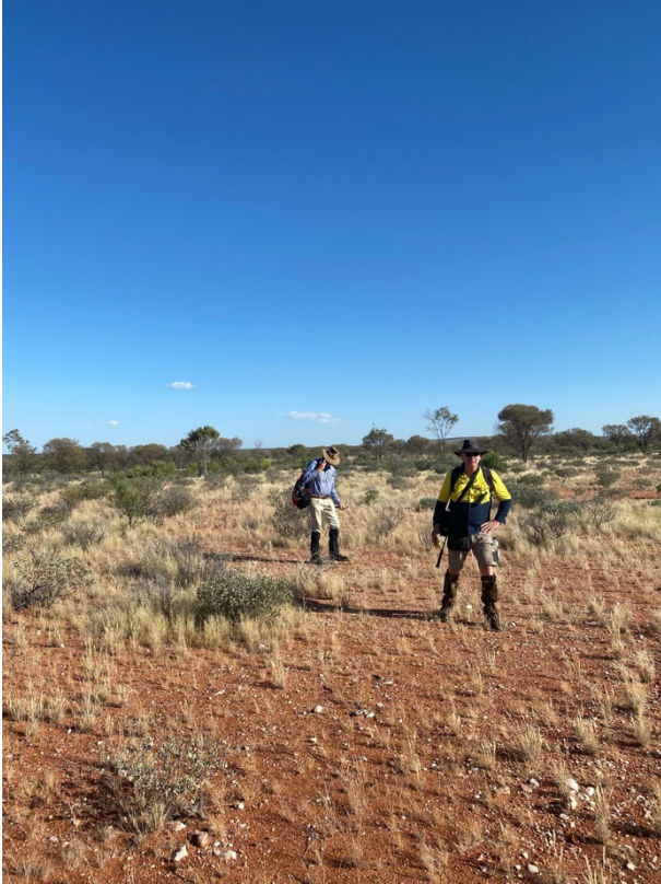
Figure 3: A8G team on site at Mt Peake.

ASX Announcement | ASX: A8G | 29 March 2022