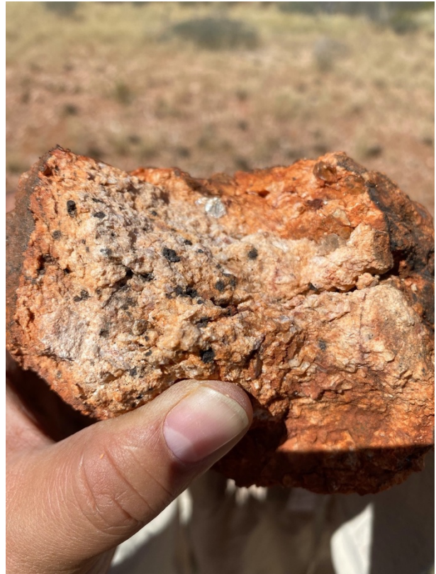
Figure 6: Tantalite identified in pegmatite rock chips.

This announcement is approved for release by the Board of Directors.