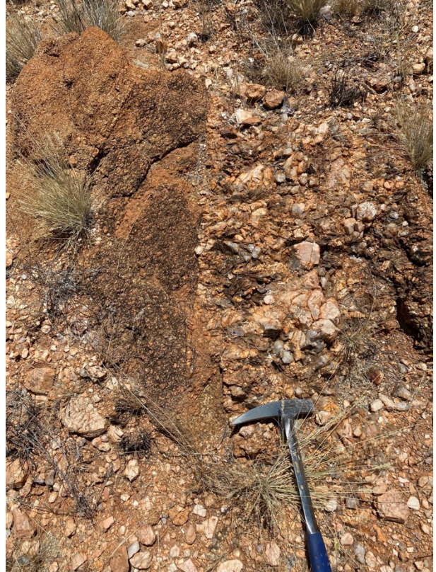
Figure 4: Pegmatite outcrop.