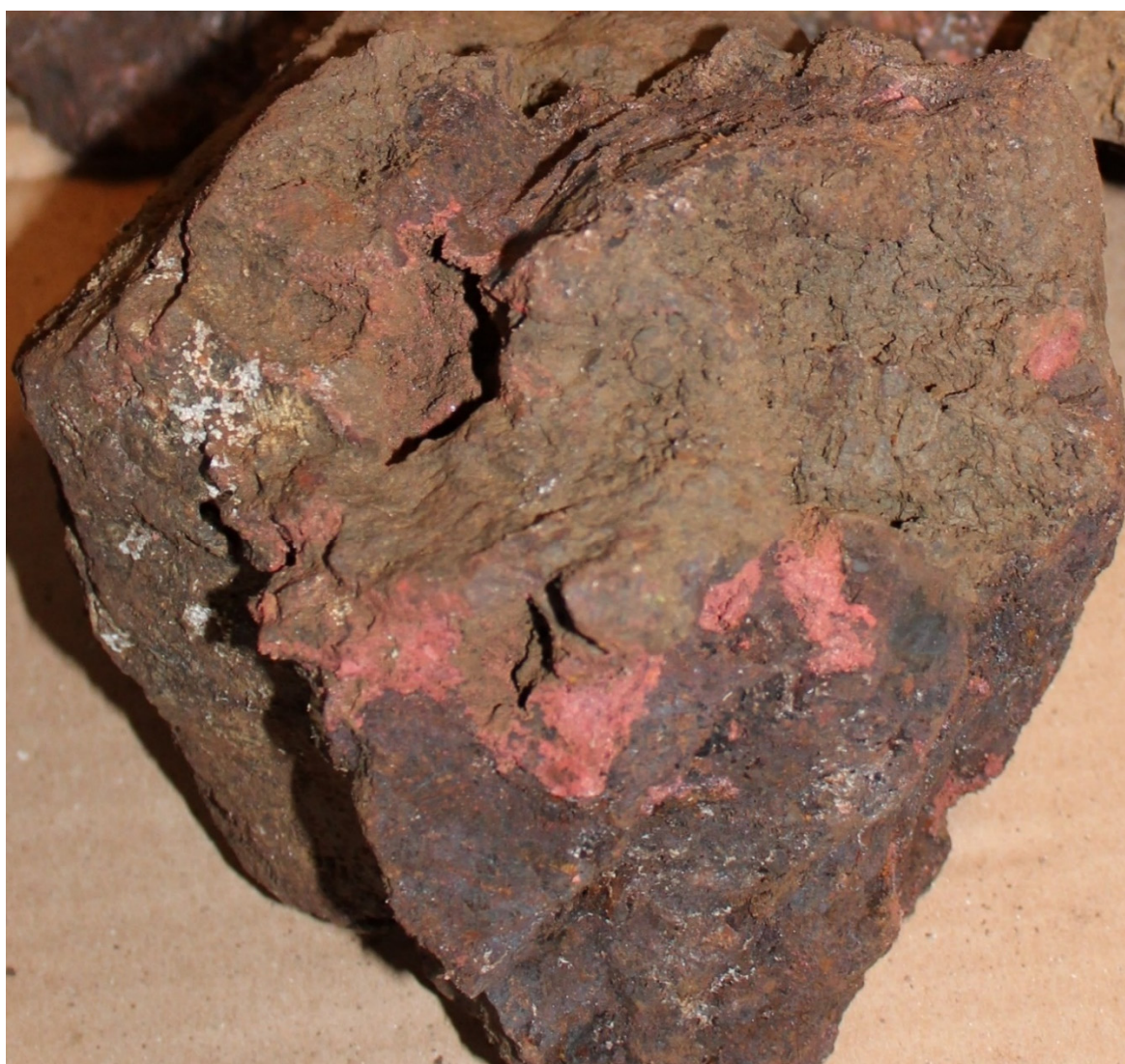
Figure 3. Grab sample G21016 from Grønnedal-Ika showing a yet to be positively identified pink mineral that is highly anomalous in REE.

Preliminary sampling by Eclipse Metals of historic drill core from Grønnedal-Ika returned significant TREO up to 22.70% in sample IVT 21-3 (see ASX announcement dated 15 th November 2021). Laboratory results and complementary XRF readings suggest that, in addition to light REE mineralisation, the Grønnedal-Ika carbonatite-syenite complex is also – at least in part – enriched in dysprosium (Dy) , praseodymium (Pr) and neodymium (Nd) . The latter are often termed the 'magnet feed' rare earth elements which are critical for high-performance magnets used by the automotive sector and in wind turbines.