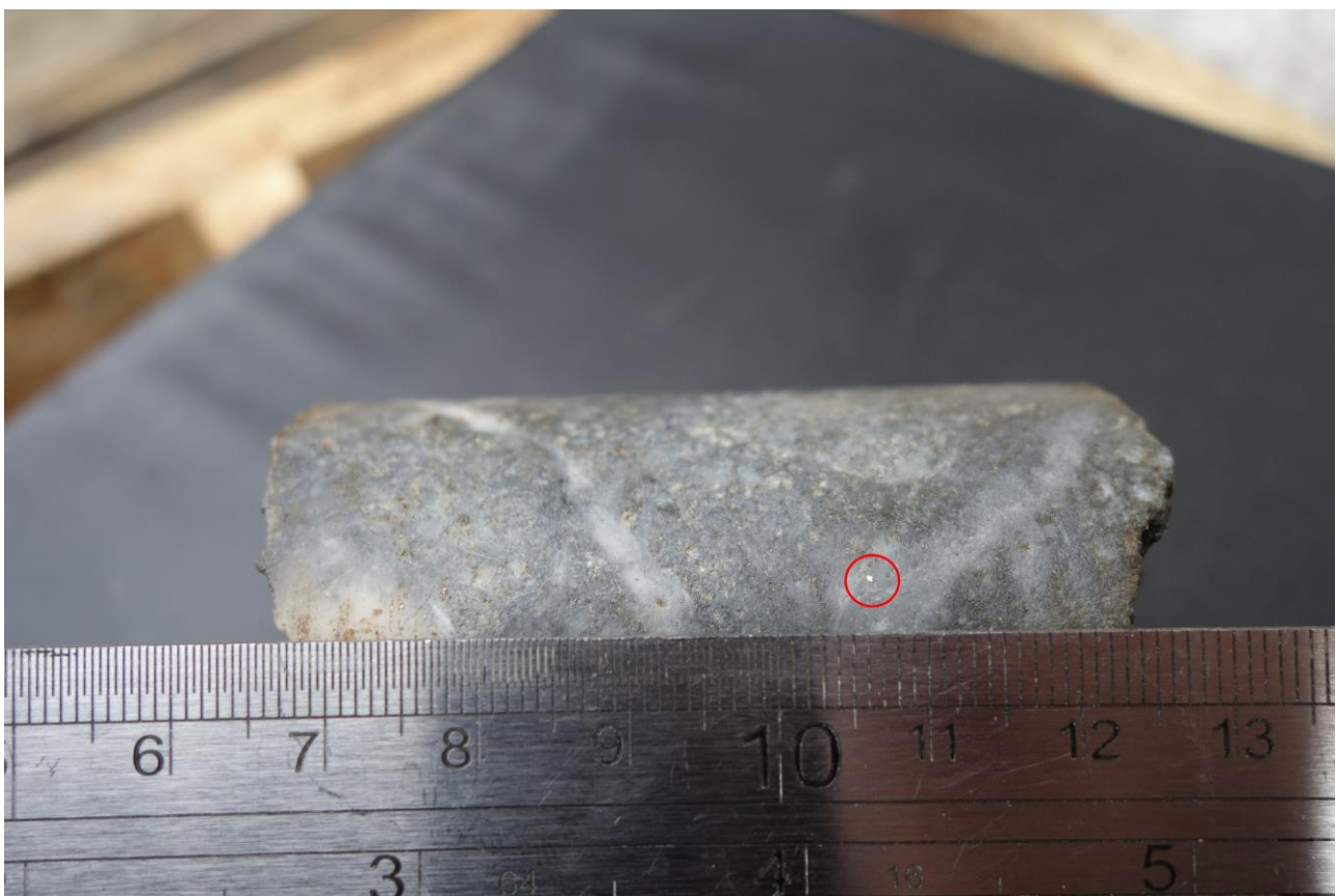
Figure 2: Drill core photo of the visible gold at 68.7m in UGA-30, in a 5-7mm wide, white to grey chalcedonic quartz-pyrite filled vein within a stockwork zone.

Note: With respect to any visible gold observed in UGA-30, it must be cautioned that visual observations and estimates are uncertain in nature and should not be taken as a substitute for appropriate laboratory analysis. Laboratory assay results will be reported when they are received and interpreted.