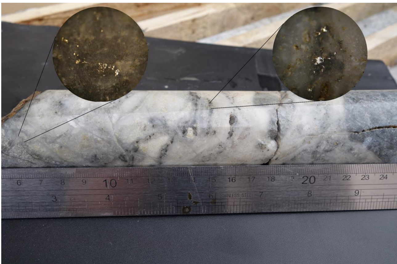
Figure 1: ~20cm wide zone containing multiple generations of drusy, fine grained, transparent to white to grey chalcedonic quartz-pyrite filled veins, some of which contain visible gold at 127.6-127.8m in UGA-30. Field of view of magnified images is ~4mm across (x40 magnification).