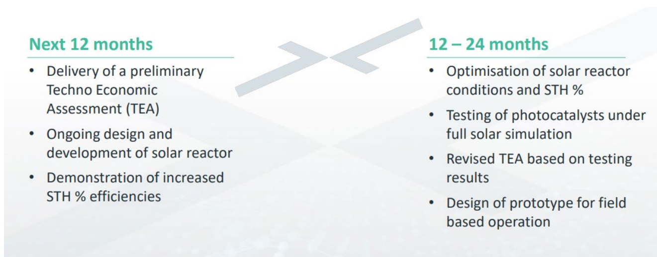
Figure 3: Key Project Milestones – Stage 1