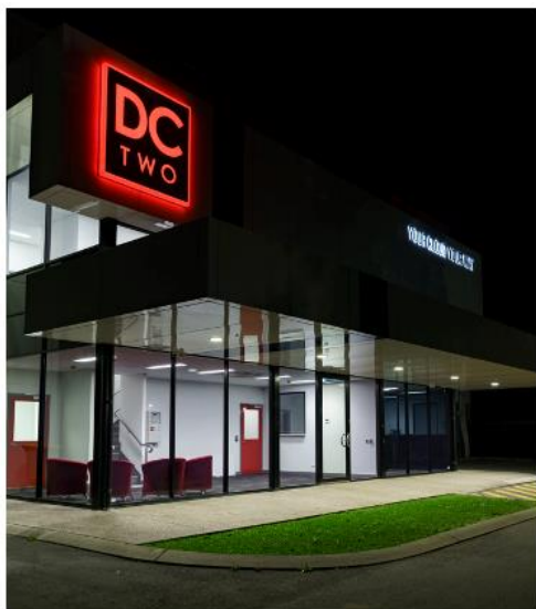
DC Two's Bibra Lake data centre