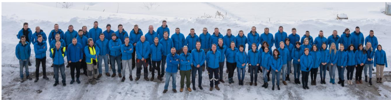
Figure 2: Group photo in Vares, December 2021