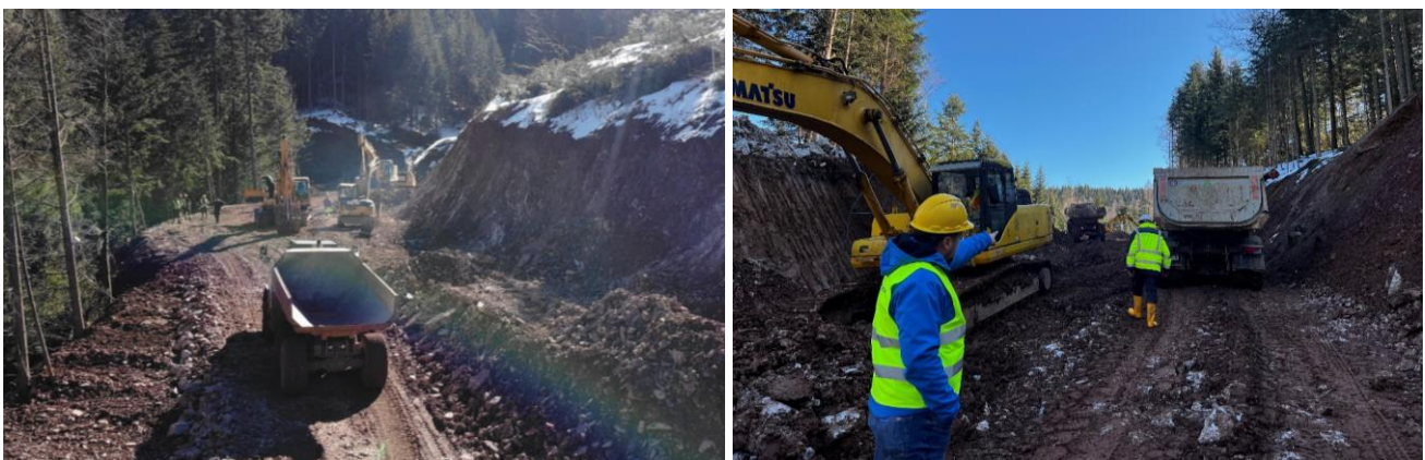
Figure 1: Site clearing and construction of the access road to the lower and upper portals at Rupice

Access road construction at the Rupice Surface Infrastructure site commenced in November 2021 and is progressing well. To date, access road sites have been cleared and a road constructed from the northern access road to Rupice (from Kakanj) to the site of the upper and lower portal pads.