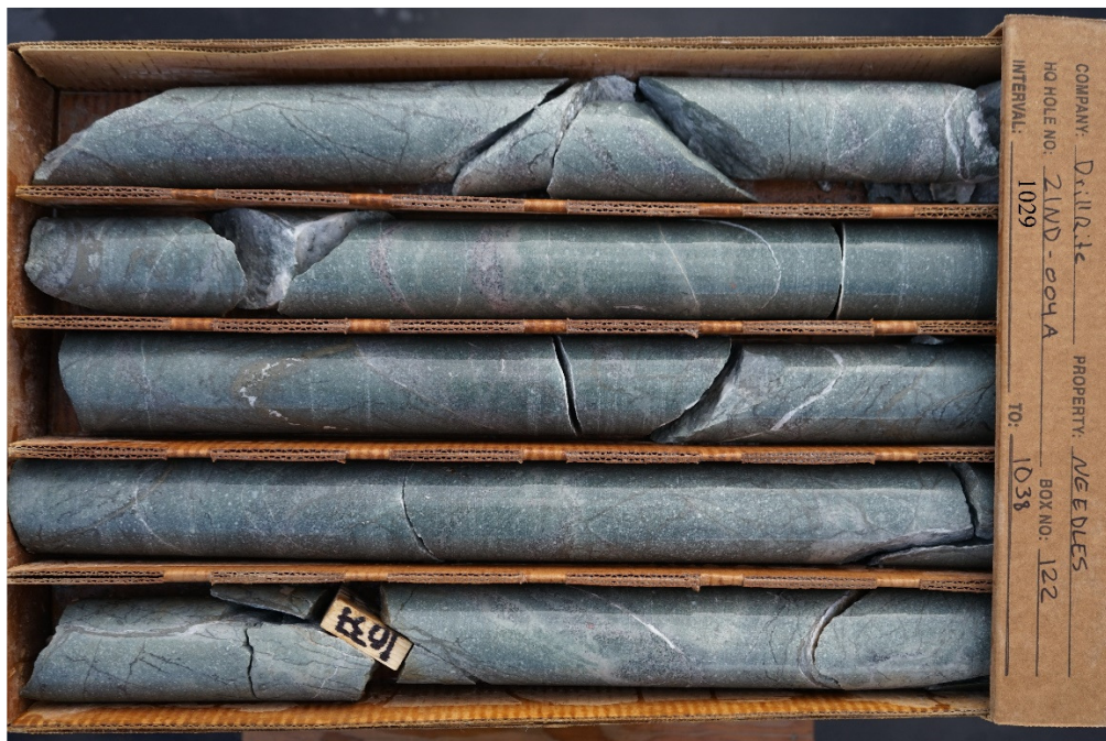
Figure 4. Example of pyrite veined andesite in hole 21ND_004A Box 122 from 1,029 to 1,038 feet (314 to 316m)- showing green propylitic altered andesite with brassy metallic veins of pyrite [1-2%].