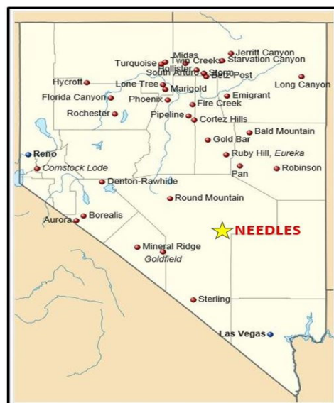
Figure 1. Needles Project Location and active gold mines

The status of the drill hole information from the current drilling program at Needles is set out in table 1 below.