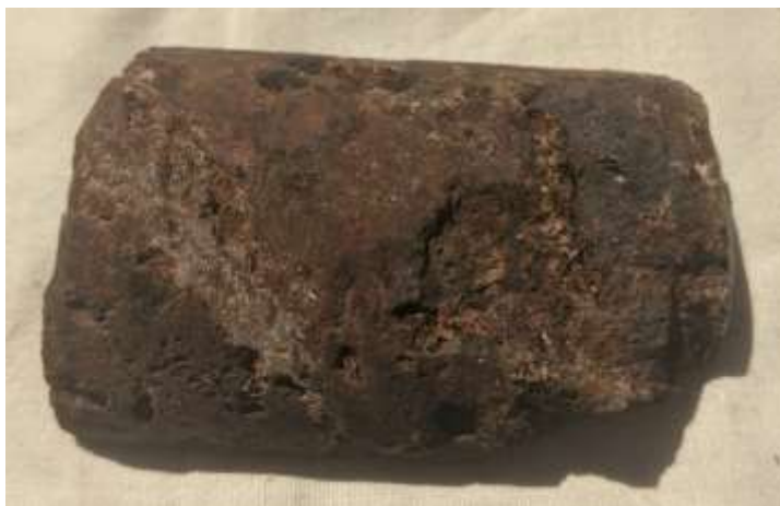
Figure 4: Grønnedal-Ika Sample (IVT 21 – 4) carbonatite, magnetite with assay results returning 203.8 ppm \text{Eu}_2\text{O}_3 and 1,245 ppm \text{Pr}_2\text{O}_3 from 2.8m

Samples of core from three of the diamond cored holes drilled in the Grønnedal-Ika carbonatite complex in the 1940s returned very significant analysis for rare earth elements with up to 22,695ppm total rare earth oxides (sample IVT 21 - 3). These holes were originally drilled to explore for deposits of magnetite (iron ore) which had developed in the contact area of later intrusive dolerite dykes.