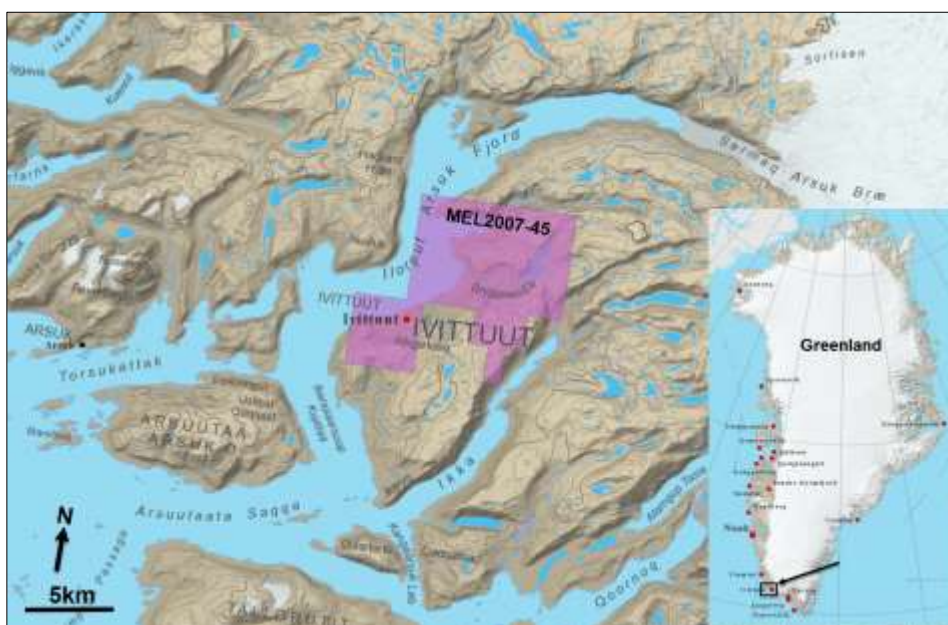
Figure 1: Ivittuut Project Location Map

In January 2021 Eclipse acquired the Ivittuut (aka Ivigtût) project and in May 2021, the Company announced it had applied for approval to undertake an initial fieldwork programme on exploration licence MEL2007-45. ( Figures 1 & 2 )