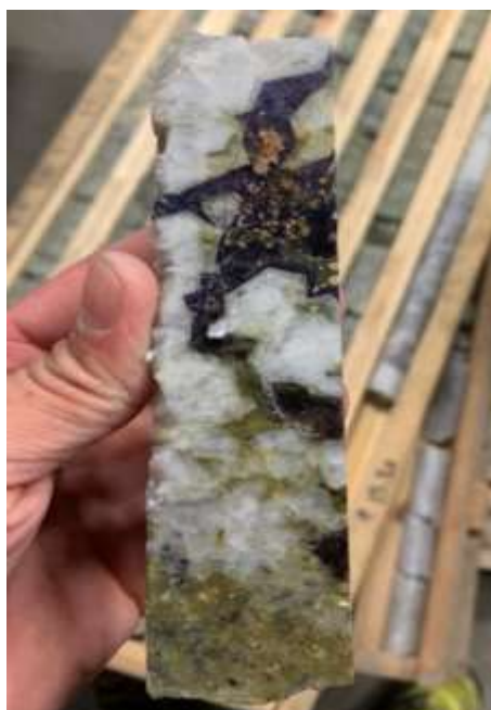
Figure 3: Drill core sample from Ivittuut pit precinct

Initial examination of historical diamond drill core from the Grønnedal-Ika carbonatite intrusive and over 19,000m from Ivittuut cryolite mine environ was conducted in August 2021. Six diamond holes with a combined length of 750m, were drilled over 50 years ago within Grønnedal-Ika carbonatite intrusive and much of the core remains uncut and untested.