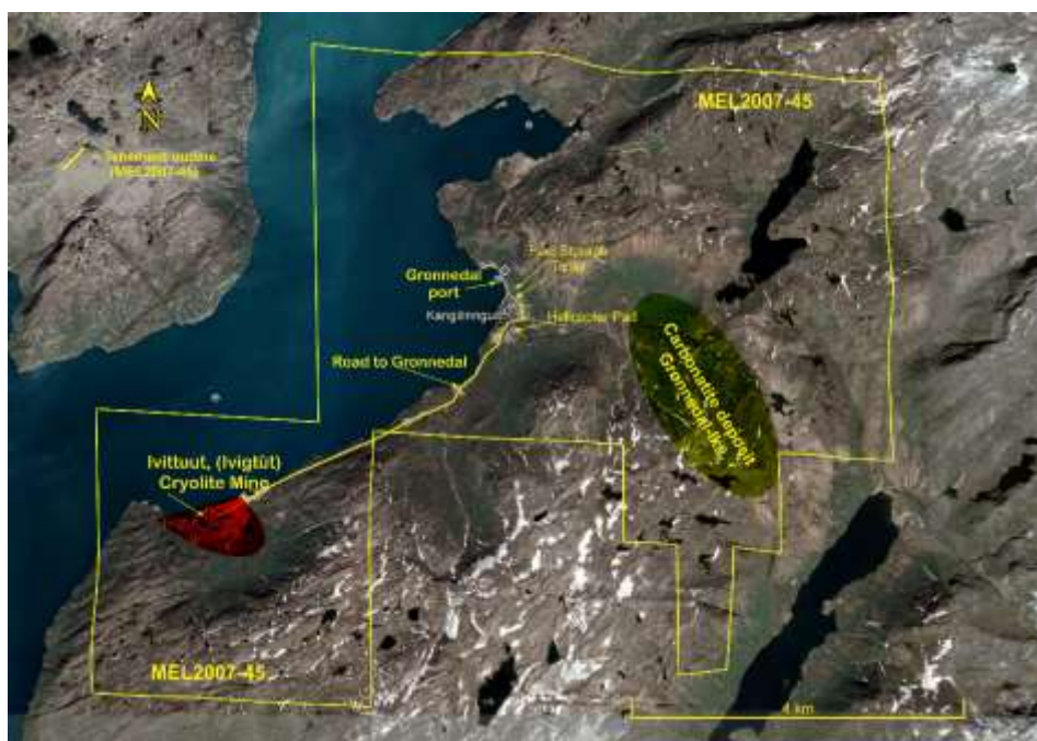
Figure 2: Ivittuut Project Tenement Map – MEL 2007- 45 - located on the coast of Arsuk Fjord in southwestern Greenland.

Approval to commence exploration field activities on 1 August 2021 was granted following receipt of formal advice from the Greenland Mineral Licence and Safety Authority. The approved programme of work at Ivittuut included field assessment and general inspection and familiarisation by the new field team, sampling of the existing mullock heaps and sampling of geological bulk intrusions.