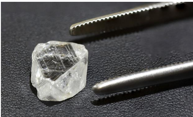
9.6ct gemstone (left).