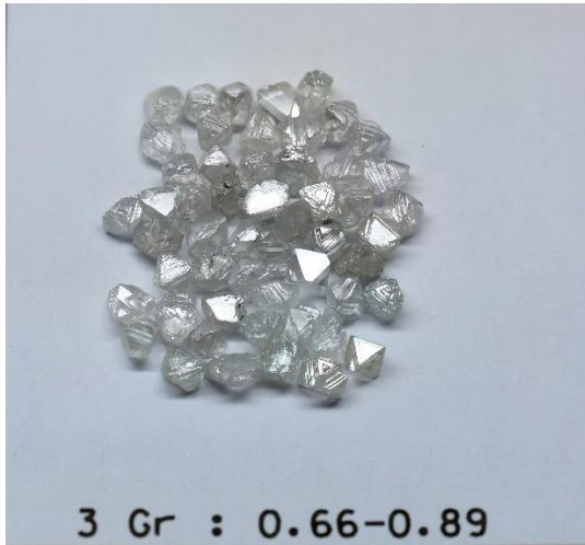
3 Grainers (left).