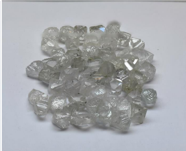
4 Grainers (right)