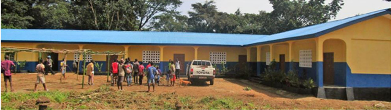
Completed Secondary School in Tongo Community