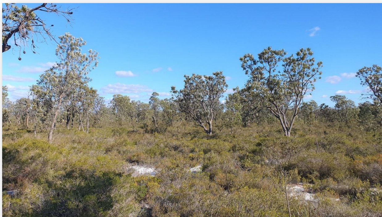
Fig 2: Muchea Banksia open woodland

The Company has had regular overseas enquiries for Muchea silica sand and believes that the consistent production of such high-grade silica sand with a low iron content will be in high demand as raw material for the manufacture of premium ultra-clear cover glass production, particularly for the burgeoning solar panel manufacturing industry.