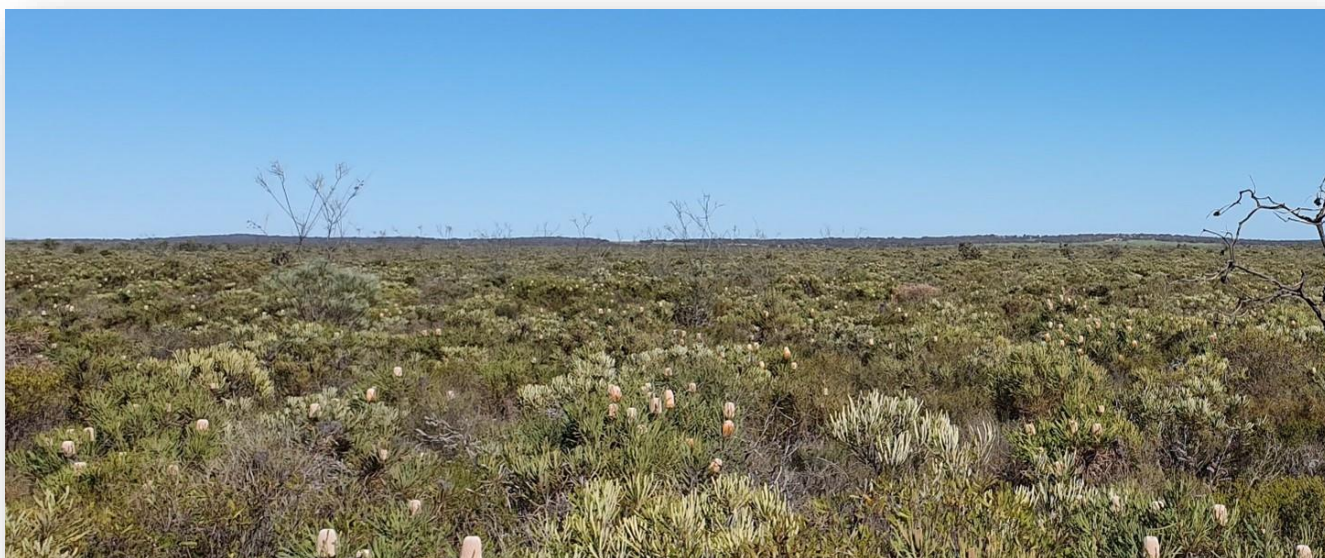
Fig 1: Arrowsmith North vegetation