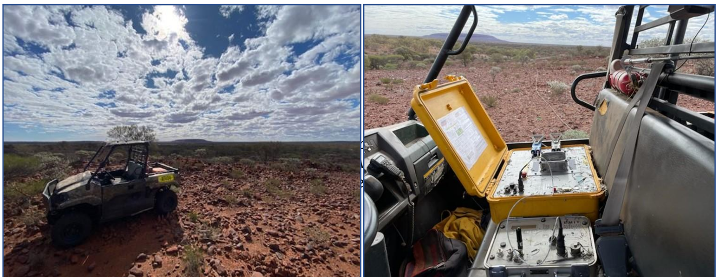
Figure 1: Wireline Services crews on site at Rixon with majestic Mt Yagahong in the background.

Peak Minerals Ltd (ASX: PUA ) ( Peak or the Company ) is pleased to announce that Moving Loop Electromagnetics ( MLEM ) surveys have commenced at our Green Rocks Project over the Rixon, Lady Alma and Target B prospects. The surveys are a critical step before drilling Heli-EM conductors. A total of 13 lines and 22 line km of surveying is planned (4 lines at Target B and 9 lines at Rixon and Lady Alma). The surveys are expected to resolve conductors identified by the Heli-EM survey and detect new, buried targets. Results are expected by the end of May.