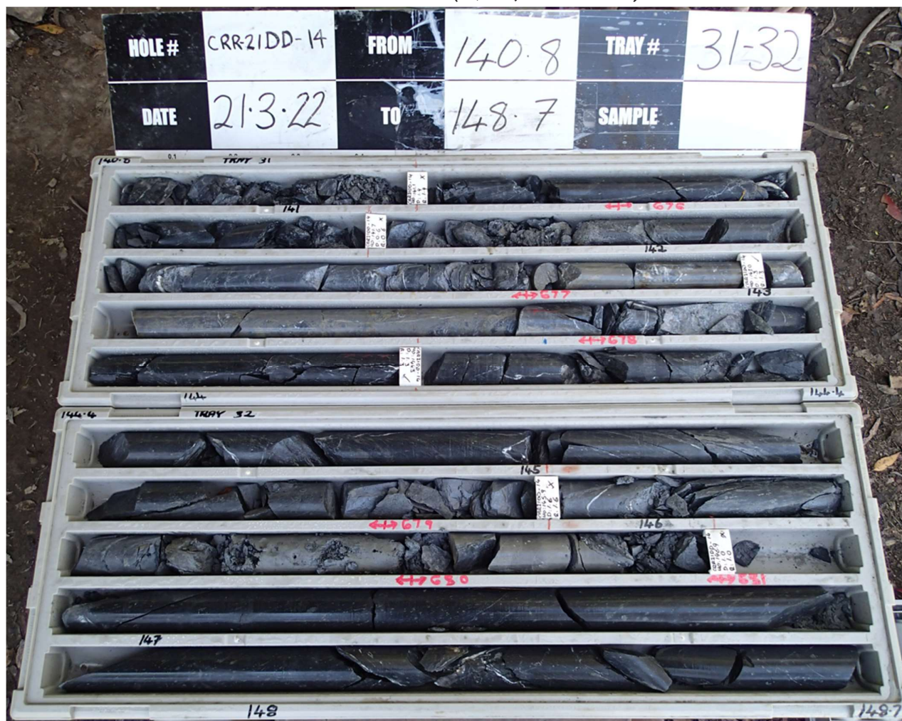
Figure 2: CRR21DD_014, detail from above Figure 1 of Sample (42)680 (146.51-146.90m downhole) exhibiting extensive massive sulphide – sample assayed 31.30% Zn, 18.30% Pb, 0.60% Cu, 59.30g/t Ag (NQ core, 50mm diameter)