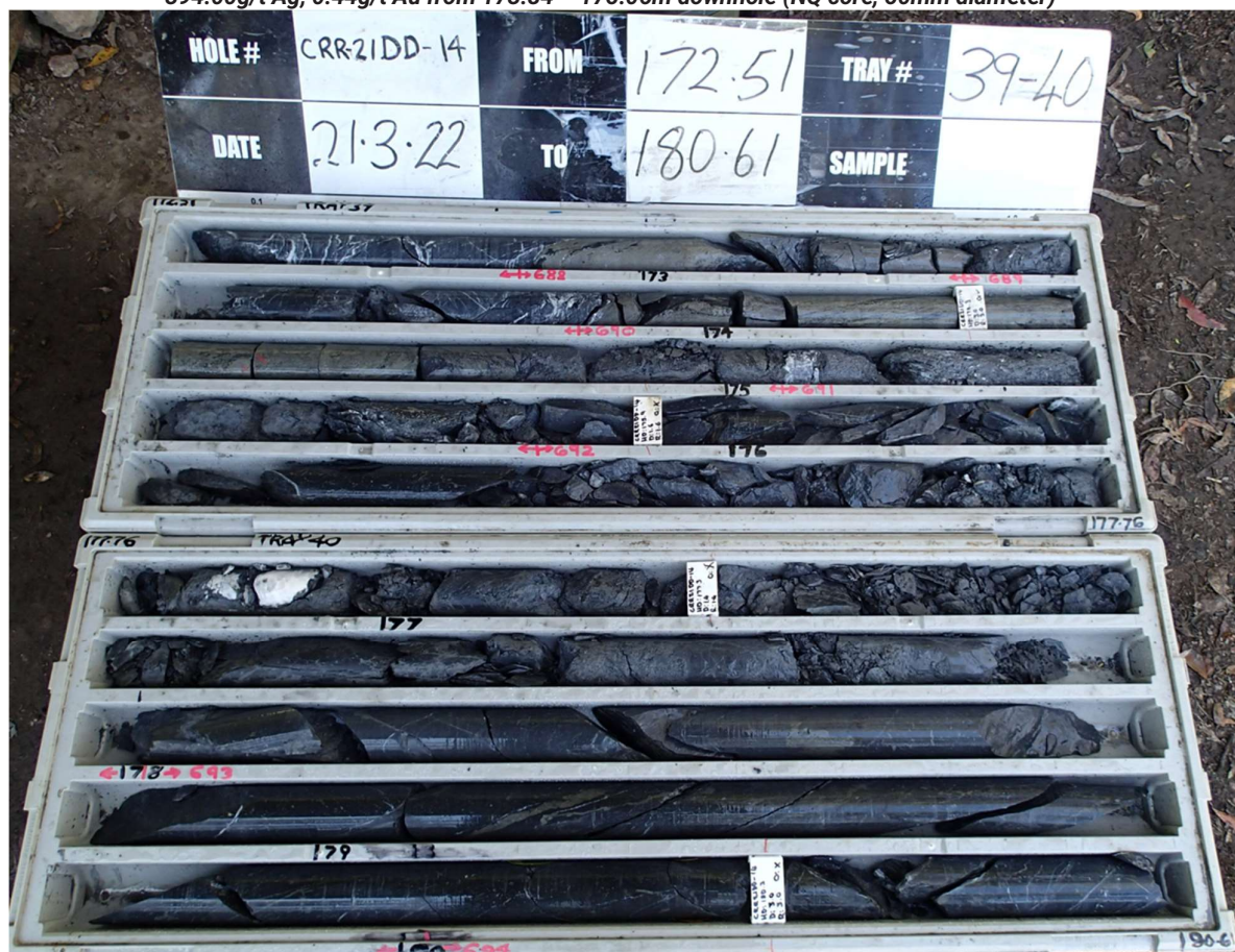
Figure 4: CRR21DD_014, detail from above Figure 3 of Sample (42)690 (173.84-175.06m downhole) exhibiting extensive banded, massive sulphide – sample assayed 25.40% Zn, 15.50% Pb, 3.46% Cu, 394.00g/t Ag, 0.44g/t Au (NQ core, 50mm diameter)