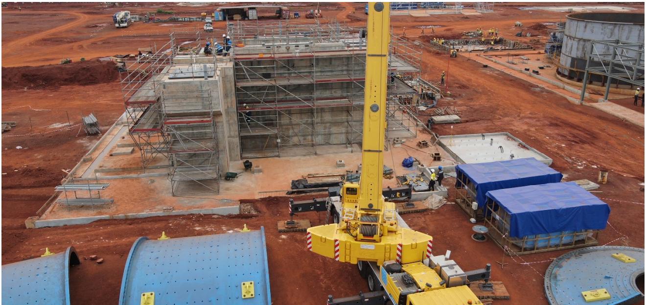
Figure 2: SAG Mill installation

Construction continues to track well against schedule, with CIL tank erection progressing and two tanks now at full height. NCP International is on site to install the SAG Mill. SMP contractor has mobilised to site and commenced work. The camp is more than 50% operational and scheduled for completion in August. Work on the tailings storage facility (TSF) and diversion channel is moving ahead. The following figures show the progress achieved on site during June 2022.