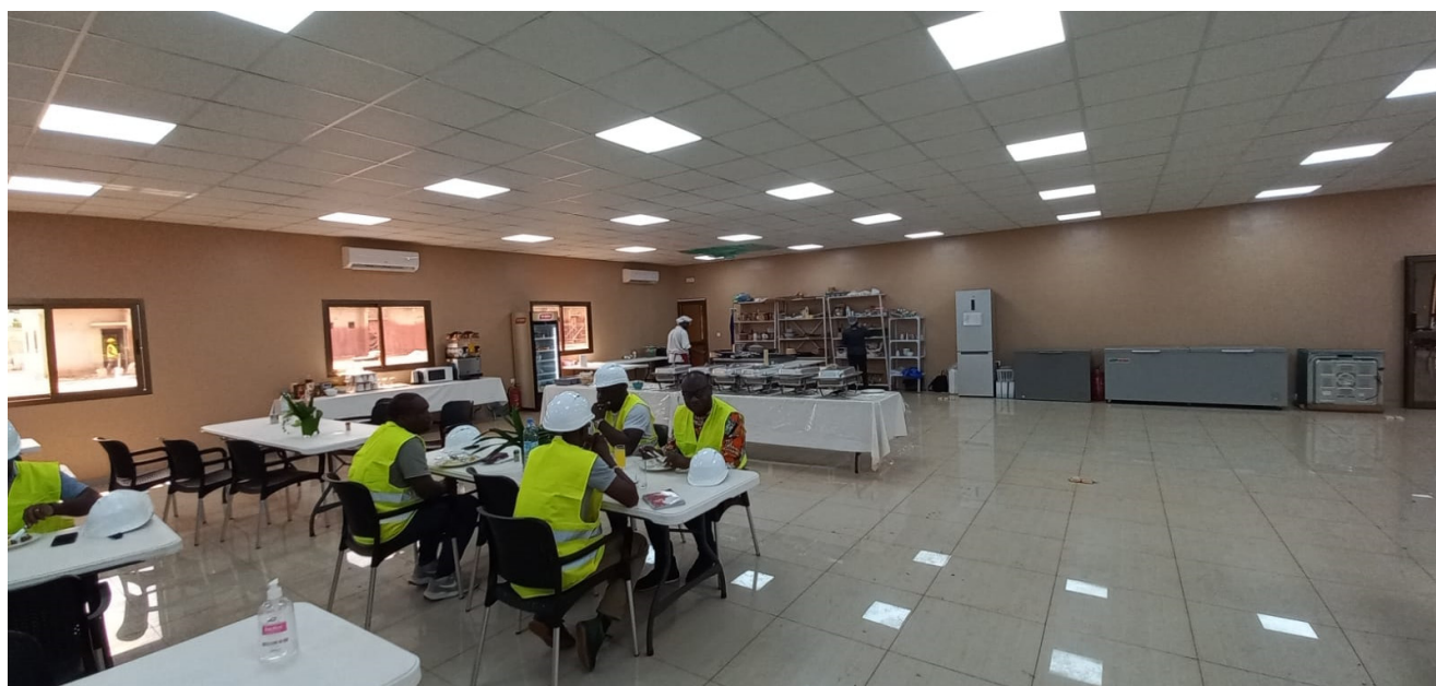
Figure 7: Cafeteria