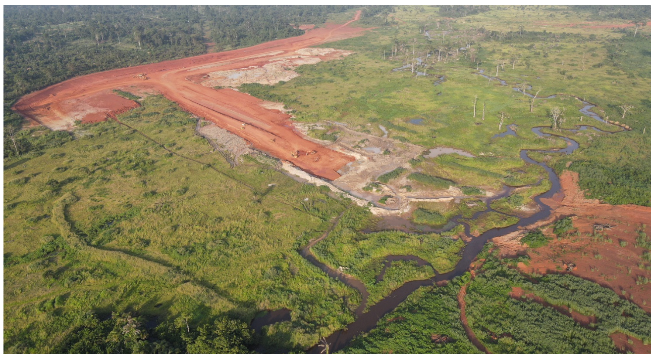
Figure 9: Water dam and diversion channel works