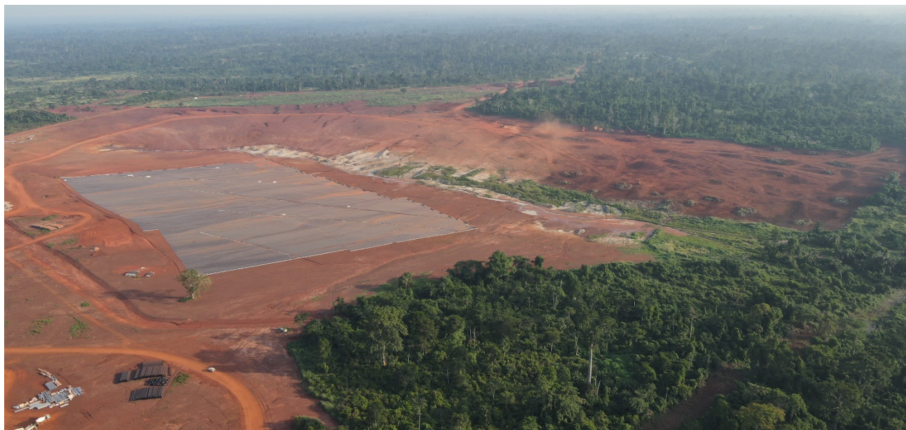
Figure 8: TSF - HDPE lining