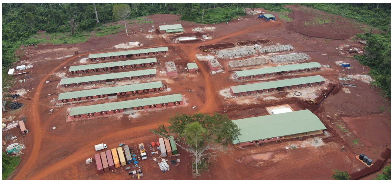
Figure 6: Overview of accommodation rooms and cafeteria