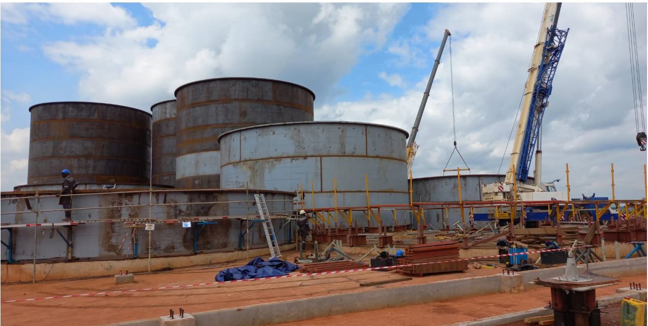
Figure 3: CIL tank construction