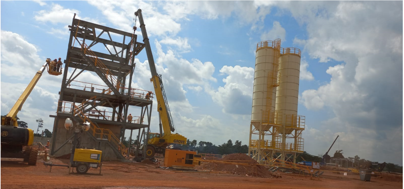
Figure 4: A-Frame and Lime silos