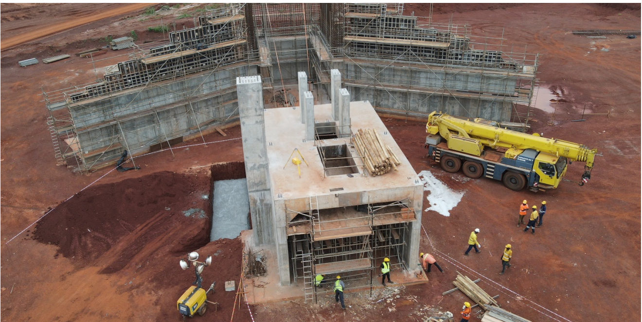
Figure 5: Crusher and reclaim chamber