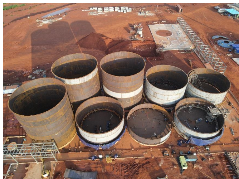
Figure 1: Overview showing construction status of Abujar's SAG Mill and CIL tanks as at 8 July 2022