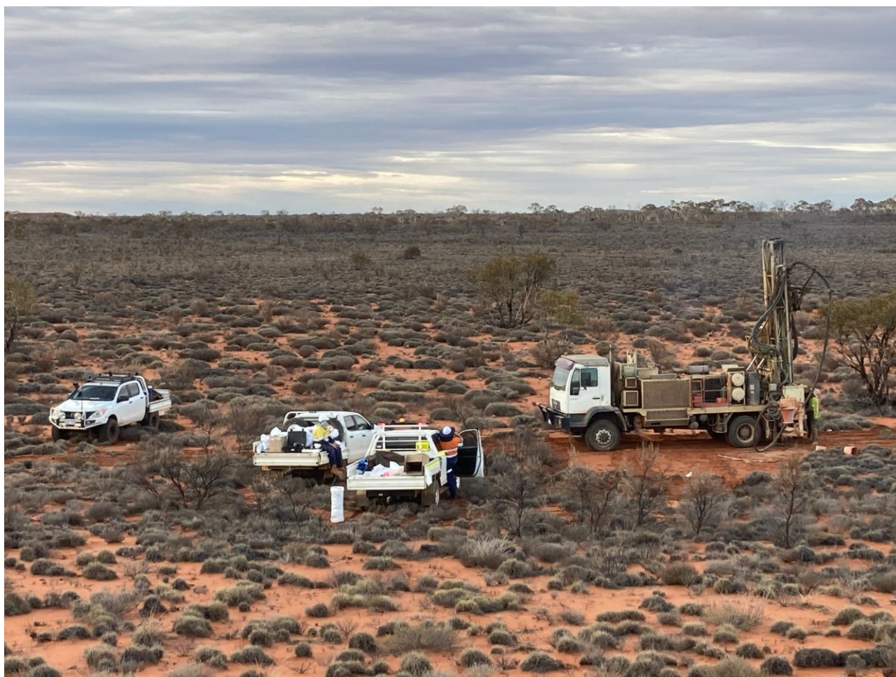
Figure 1: Air-core drilling underway at the Four Mile Well Gold Project.

Gold, lithium, and base metals exploration company Golden State Mining Limited (ASX code: "GSM" or the "Company") is pleased to provide an update on its exploration activities and new drill program now underway at the Four Mile Well project near Laverton, Western Australia.