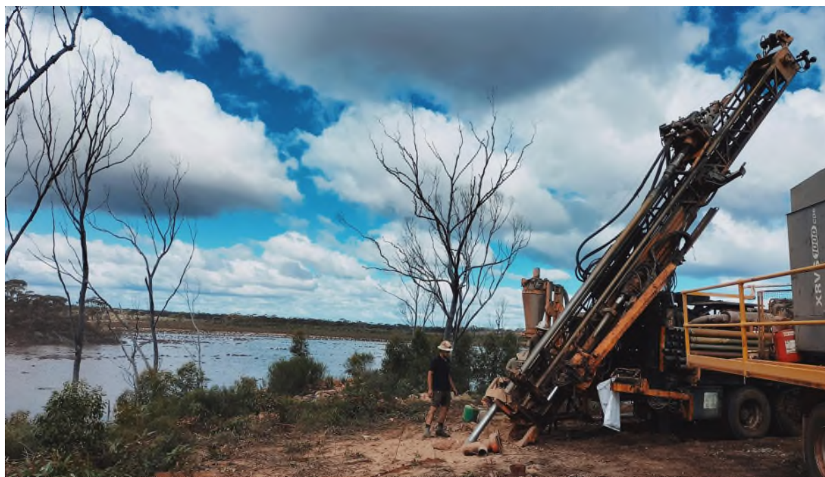
Figure 1: RC drilling rig at the Albion project area on 24 May 2022.

Mt Monger Resources Limited (ASX:MTM) ( Mt Monger or the Company ) has completed a drilling campaign at several prospect areas within the Albion project located near Norseman in Western Australia. A total of 22 reverse circulation ( RC ) percussion drill holes have been completed, for a total of 1,928 metres of drilling (Appendix I). Mt Monger has the right to acquire 100% of the Albion tenement under an existing option agreement with the licence holder.