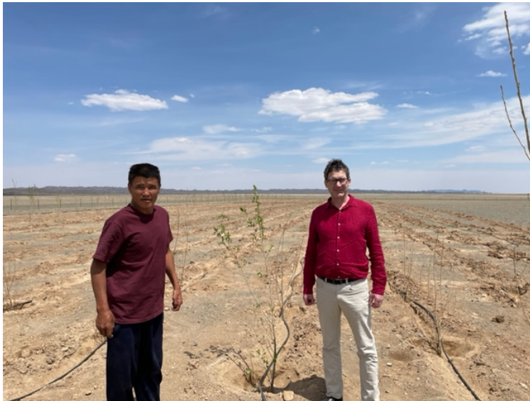
Elixir sponsored tree plantation in Nomgon

Managing community relations is a top priority for Elixir (as we believe it needs to be for any resources company). We recently opened a tree plantation in the small Gobi town of Nomgon. The Mongolian Government strongly supports tree planting efforts as part of a broad program to fight desertification, mitigate carbon emissions, etc.