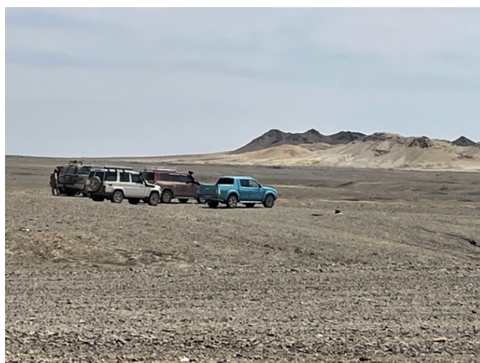
Elixir, Monbag and Major personnel survey the pilot production site

The Company's extended pilot production program is advancing in parallel to the exploration and appraisal drilling. Experienced Mongolian contractor Monbag LLC has been hired to construct the civil works and this will commence shortly. The spudding of the first of the two production wells by drilling sub-contractor Major Drilling is expected by around the end of August 2022.