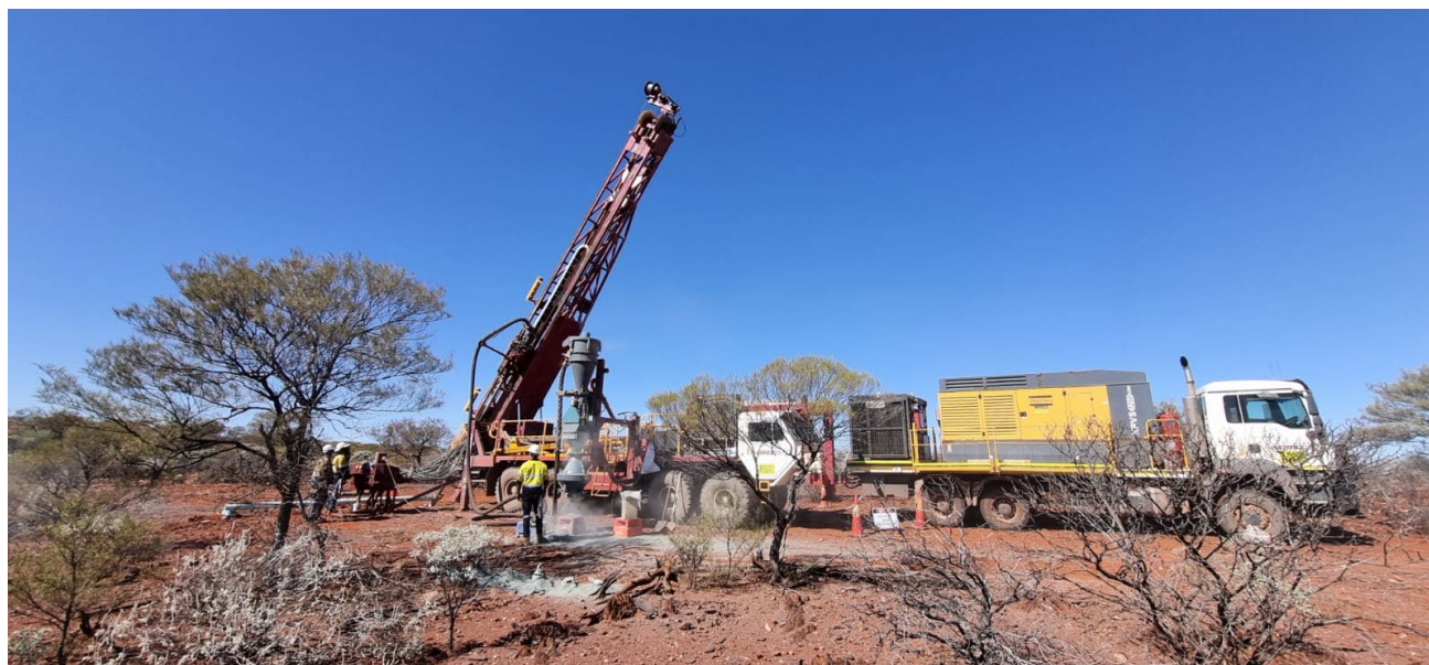
Figure 1 – Rabbit Bore drilling commences

“The drilling will evaluate the most anomalous areas, with assay results expected to be returned progressively from June. With drilling approvals either in place or pending for Maguires, Mt Davis and Peterwangy, we expect further drilling to progress immediately after this programme, with the priorities to be finalised following further geochemistry results expected in May. The remainder of 2022 is expected to see a high level of exploration activity and we are excited to have the opportunity to unlock the full potential of our highly prospective projects.”