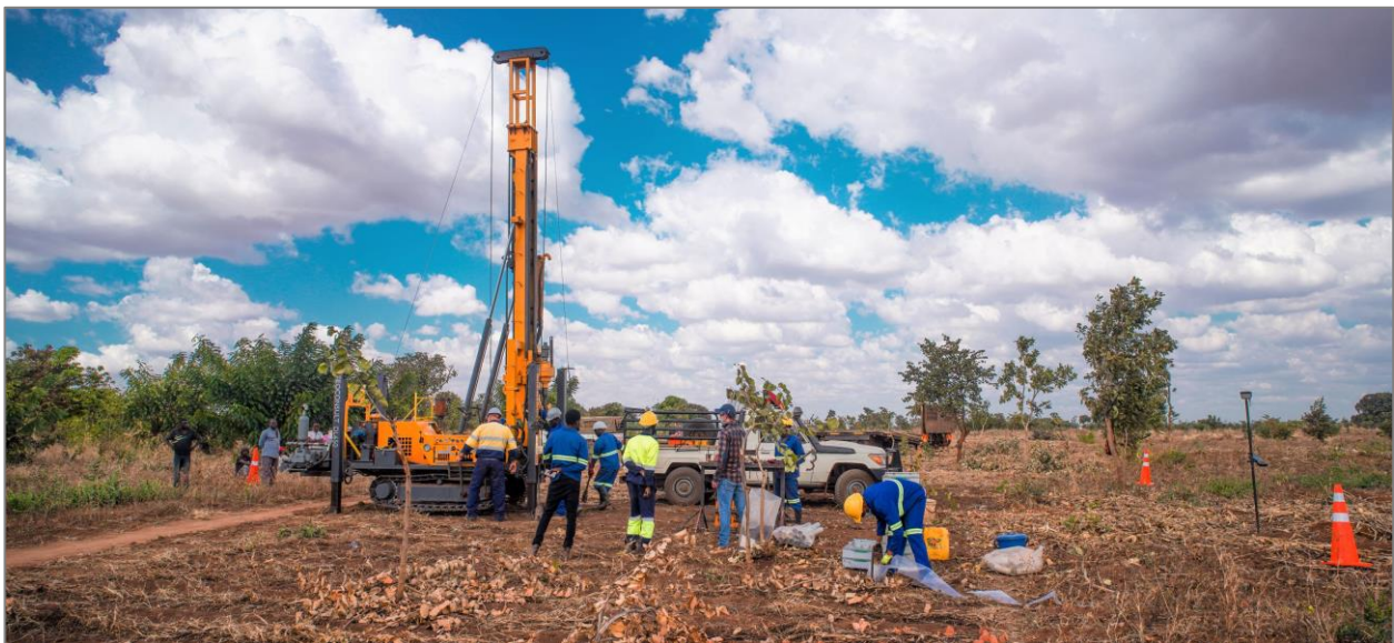
Figure 3: DL650 push-tube core drilling rig in operation at Kasiya