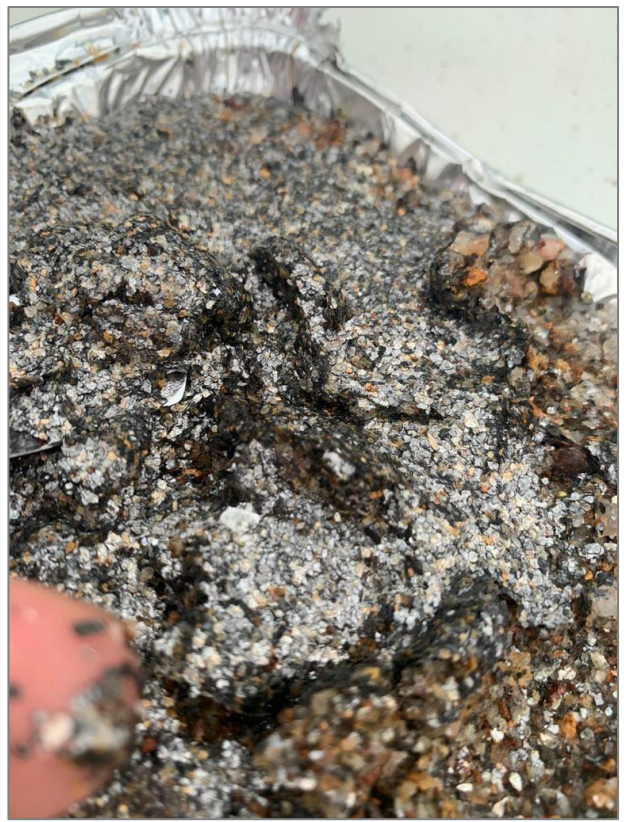
Figures 4 & 5: Coarse-flake graphite in drill core sample from Kasiya (left) & very coarse-flake graphite in the +600µm coarse sand fraction of a sized, raw drill sample (right)