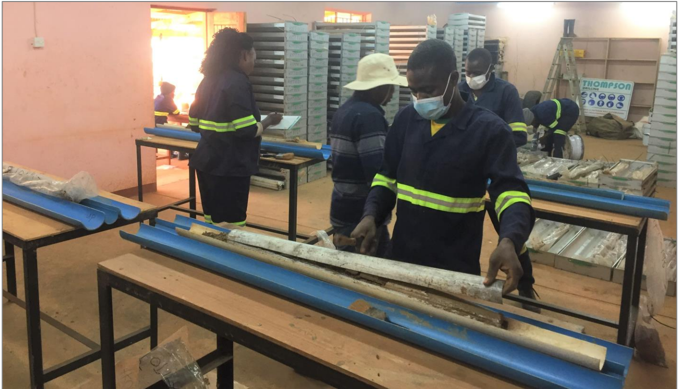
Figure 5: Logging and sample preparation of drill core from Kasiya