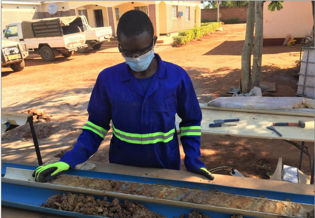
Figure 2: Sampling drill core from the push-tube program

It is currently interpreted that these deeper, NE-striking zones of rutile mineralisation should extend to the base of the soft, friable saprolite estimated to be at approximately 25m depth. The Company will consider testing this deeper rutile mineralisation with sonic or air-core drilling in the 2022 field season.