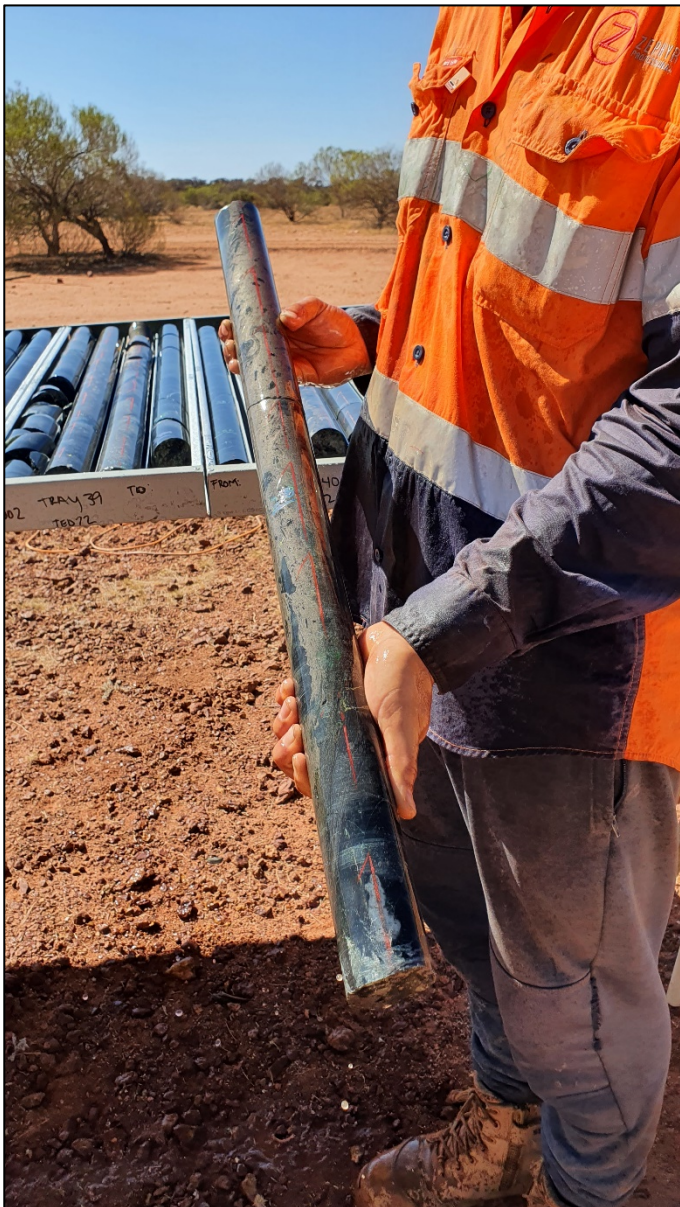
Figure 1: Lens of massive nickel sulphide intersected in diamond drill hole TED22 at Dusty 1. See text for further details.

Drilling has intersected a 5.8m zone (downhole) of visible nickel sulphides containing lenses of massive nickel sulphides up to 1.3m thick (downhole) from 253.4m downhole, in diamond drill hole TED22 (see Figure 1 ) and 3.7m of visible nickel sulphides from 186m downhole in diamond drill hole TED21 .