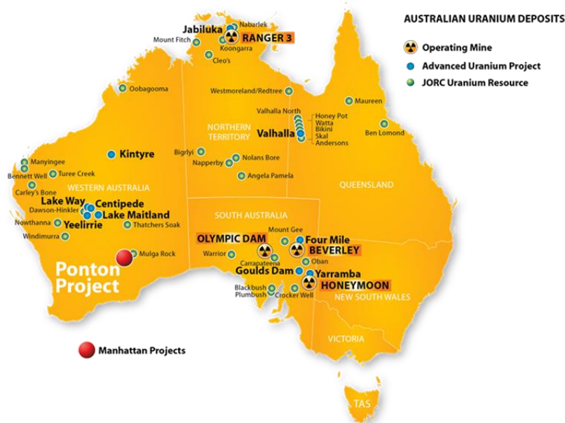
Figure 1: Ponton Project Location

Manhattan's Ponton uranium project is located approximately 200 km northeast of Kalgoorlie (Figure 1) on the edge of the Great Victoria Desert in WA. The Company has 100% control of around 460km 2 (Figure 2) of exploration tenements underlain by Tertiary palaeochannels within the Gunbarrel Basin. These palaeochannels are known to host a number of uranium deposits and drilled uranium prospects (Figure 2).