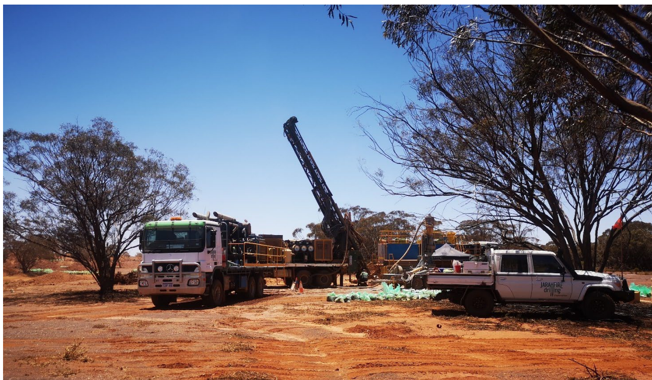
Figure 1: RC rig drilling Resource extensional holes at the Fingals Mining Centre (January 2022)