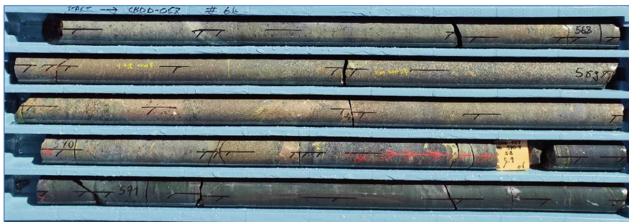
Figure 3: Basal breccia style globular to massive mineralisation observed in CBDD057 grading 3.7% nickel. This style of mineralisation does not always yield a strong DHEM geophysical response.