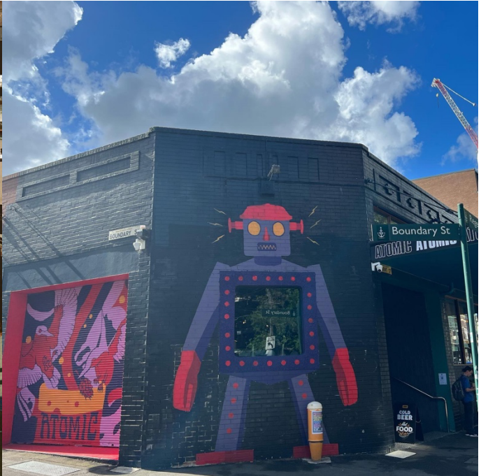
Figure 5 Atomic Redfern