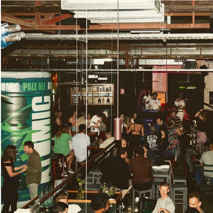
Figure 4 Atomic Redfern