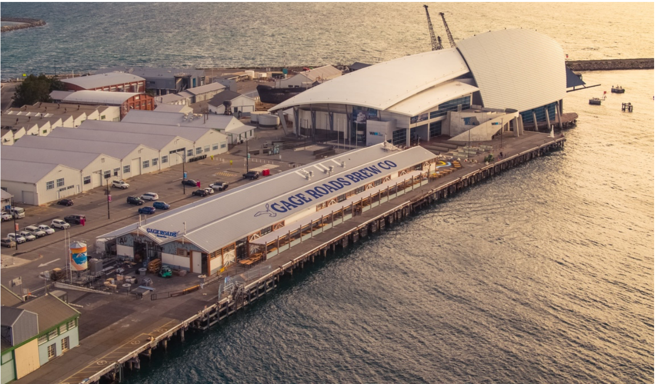
Figure 1 Gage Roads Freo