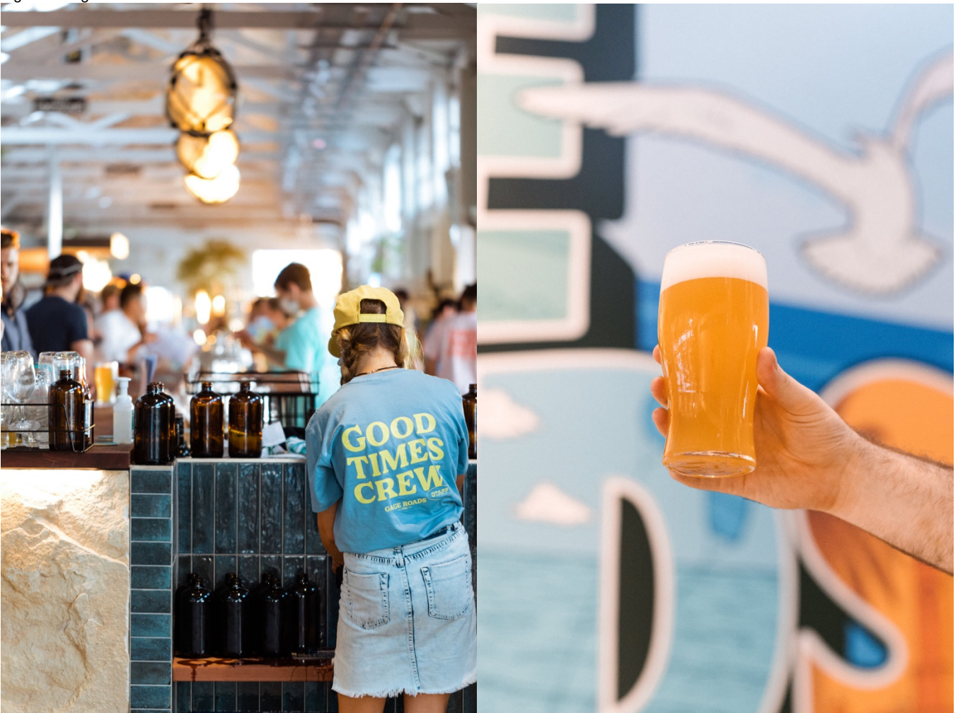
Figures 2&3 Gage Roads Freo