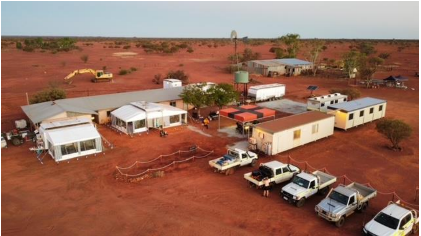
Figure 3: Completed camp setup for Yandal and Earraheedy projects

The Company looks forward to providing further updates to the market as its various exploration programs progresses.