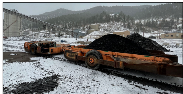
Battery powered hauler being tested at New Elk