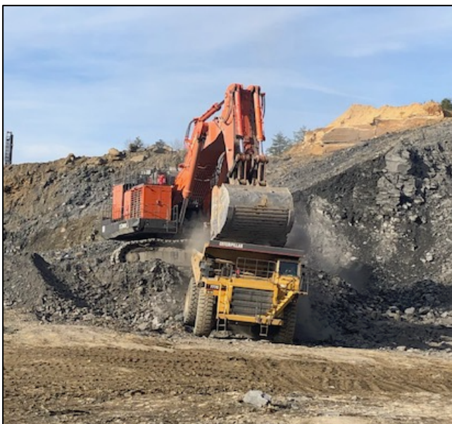
3600 Hitach Excavator operating at Black Warrior

As was announced previously, Black Warrior operated a mix of 18 x 50t and 60t dump trucks and following the acquisition, we contracted to acquire four new Hitachi 200t dump trucks for November delivery. During the quarter however, six second hand 150t CAT dump trucks became available, and management decided to purchase these machines, which are less costly and operationally less complex. These trucks have begun to arrive at the mine and will be in production mid-February. This will provide the step-up from our current average of 20kt per month to 45kt per month target.