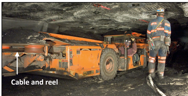
Electric cable shuttle car underground at New Elk

Management anticipates productivity gains to follow such an investment.