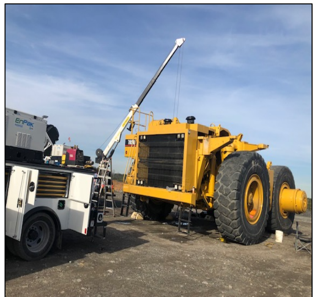
150t CAT dump truck being assembled at Black Warrior