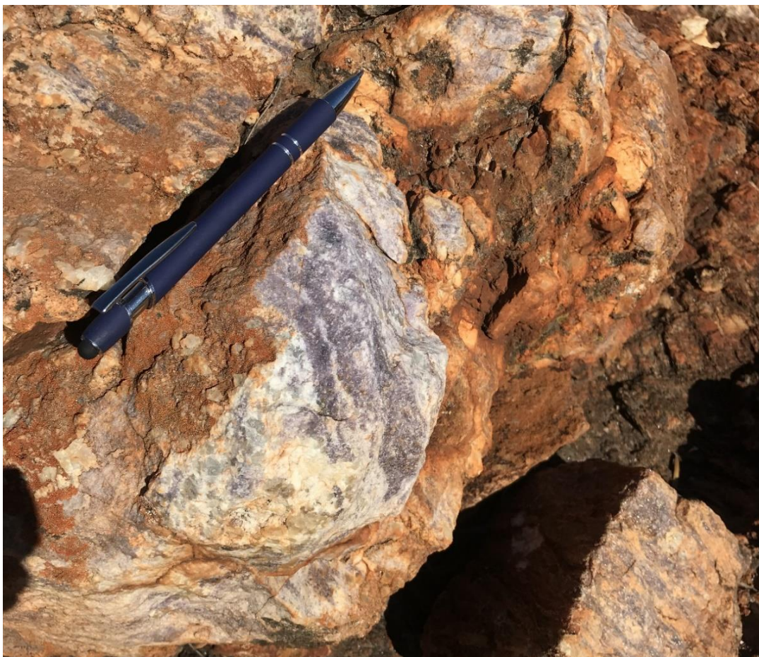
Figure 1: Foundation Lithium – Caesium – Tantalum (LCT) Pegmatite, Manindi Project, WA

In addition to the drilling program, the Company has recently completed a systematic rockchip channel sampling campaign. The channel sampling averages 40m line-spacing over the entire 500m strike length of the recently discovered Foundation Pegmatite (see Figure 1, below) and other nearby Pegmatites (e.g. Dibbler Pegmatite ) (see location, Figure 2), which remain untested by drilling.