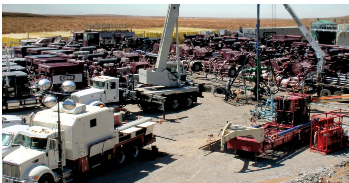
Figure 1. A Cudd Energy Services completions spread

CES, founded in 1977 in Oklahoma, is an integrated oil and gas field service company and leading provider of innovative technology in completion applications, and is one of several oilfield service companies owned by RPC Inc. ( RPC ) (NYSE: RES, market capitalisation of US$1.2bn). RPC provides a broad range of specialized oilfield services and equipment primarily to independent and major oil and gas companies engaged in the exploration, production and development of oil and gas properties throughout the US, including the southwest, mid-continent, Gulf of Mexico, Rocky Mountain and Appalachian regions, and in selected international markets.