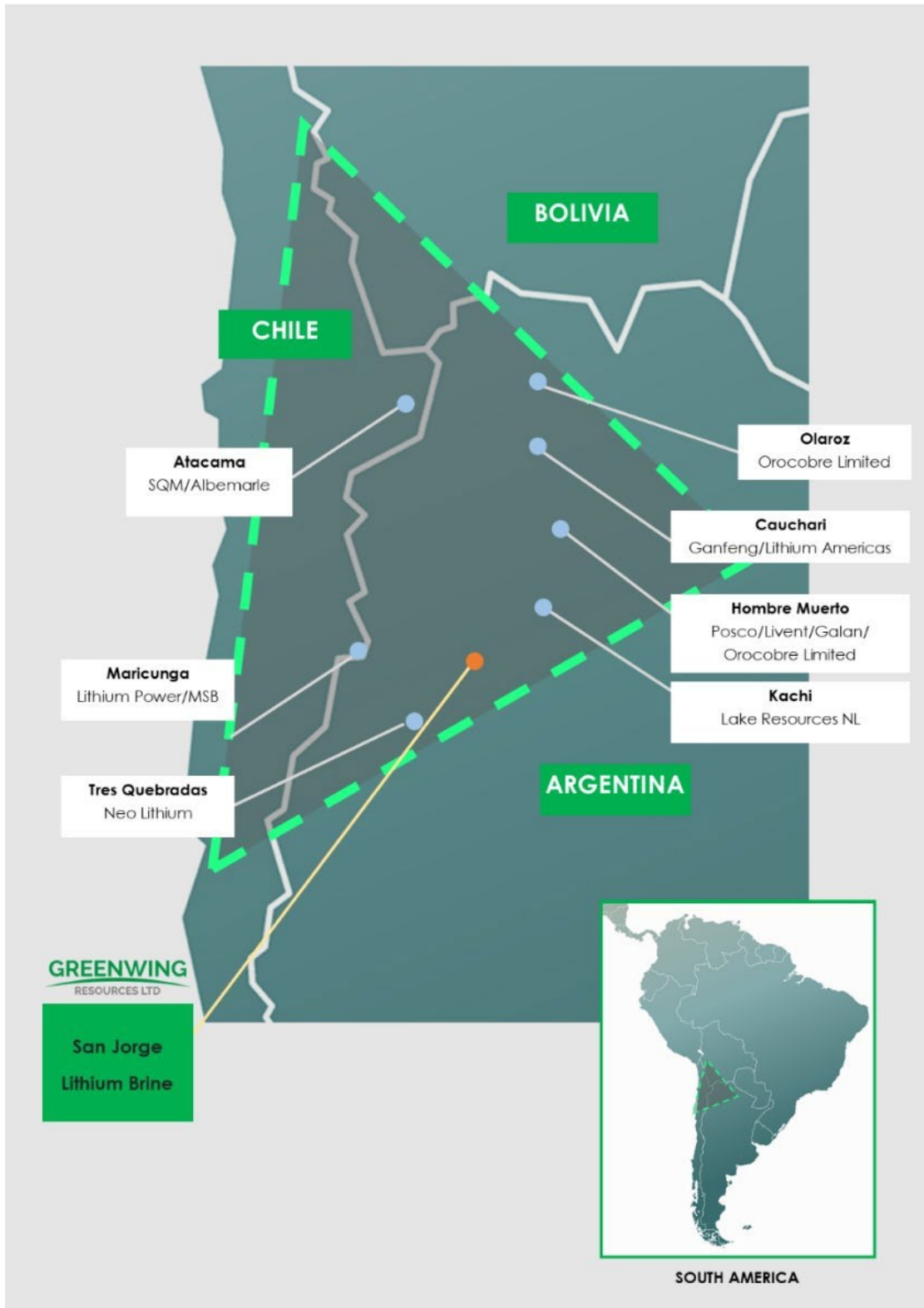
Location of the San Jorge Project.