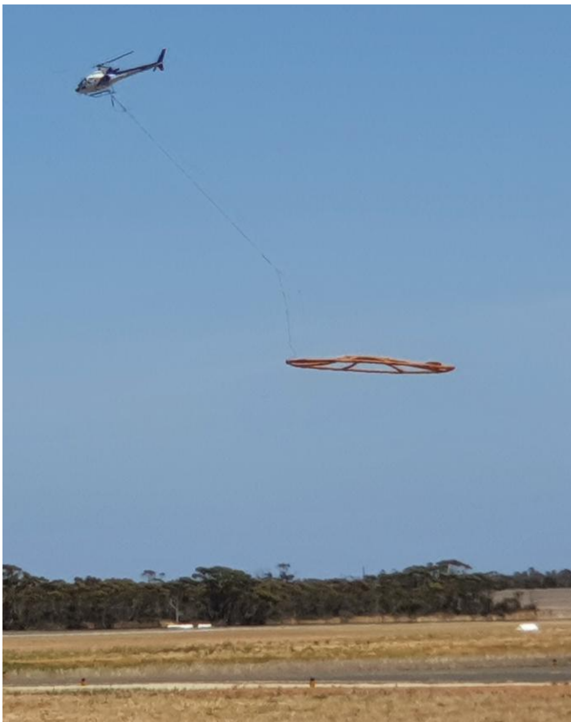
Figure 1 – Squirrel helicopter with NRG’s Xcite electromagnetic system on site at Ravensthorpe (January 2022)