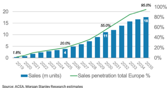
Table 1. Europe BEV sales volumes (m) and penetration (%)

The Company anticipated releasing a Scoping Study (Study) in Q4 2021 prior to the release of the Feasibility Study (FS) by mid 2022 however peer reviewing has been delayed due to the holiday season. The Study is anticipated to be released in late January 2022.