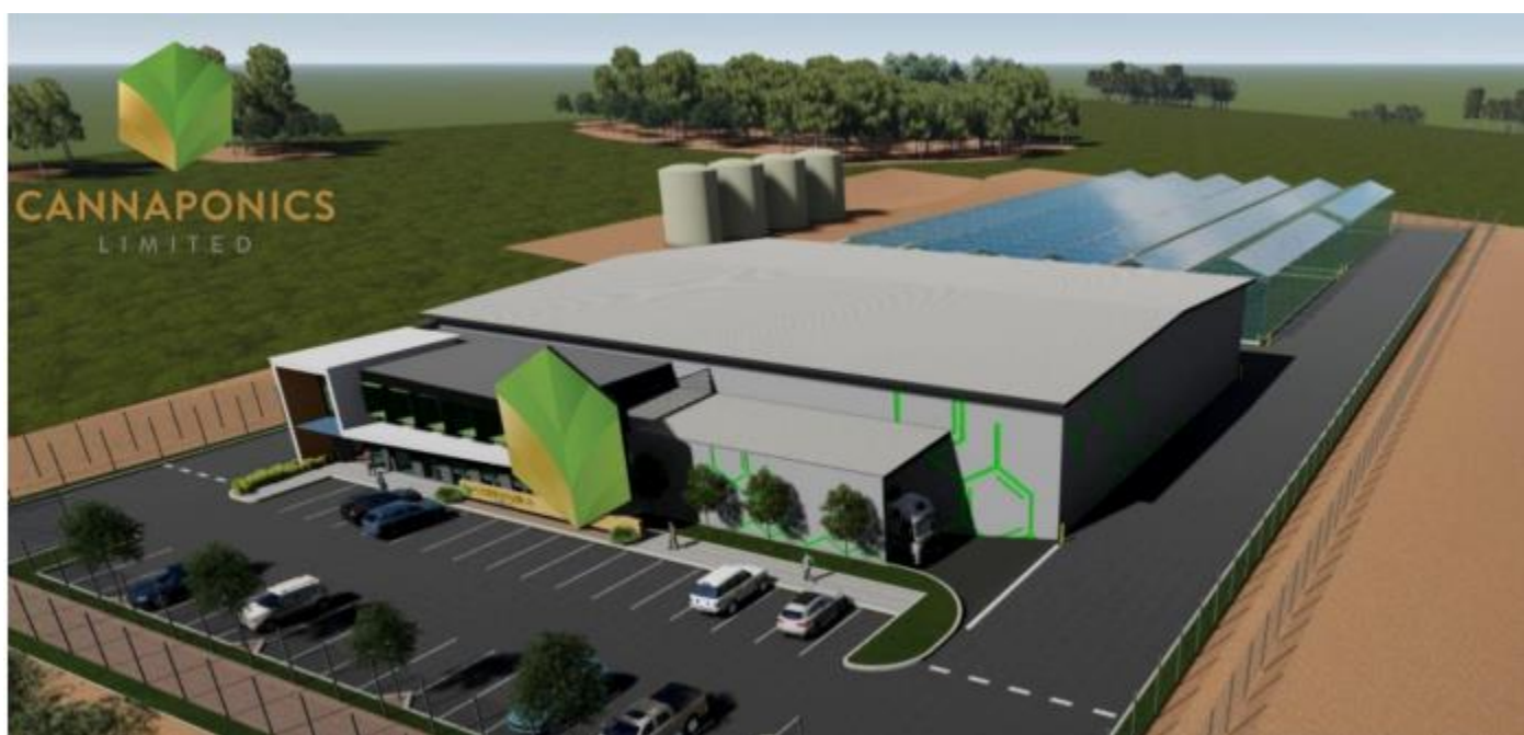
Concept render of the Cannaponics Limited facility in Collie

The collaboration will also explore the possibility to re-use the low-grade waste heat produced by the data centre modules to heat the greenhouses as needed, effectively using the electrical power energy twice, firstly to power the data centre and secondly to heat the greenhouses.