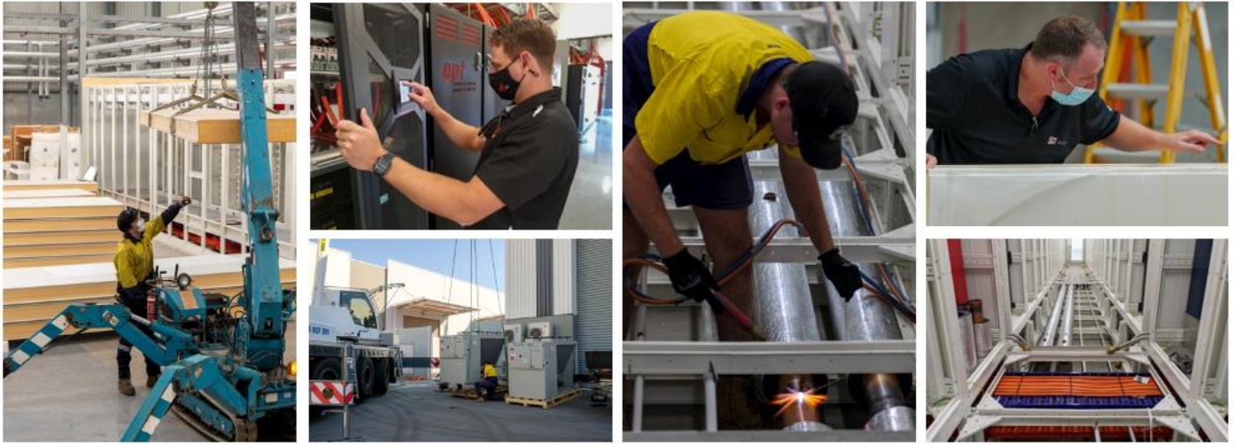
Above: Multiple suppliers working towards Bibra Lake State 1 fit out