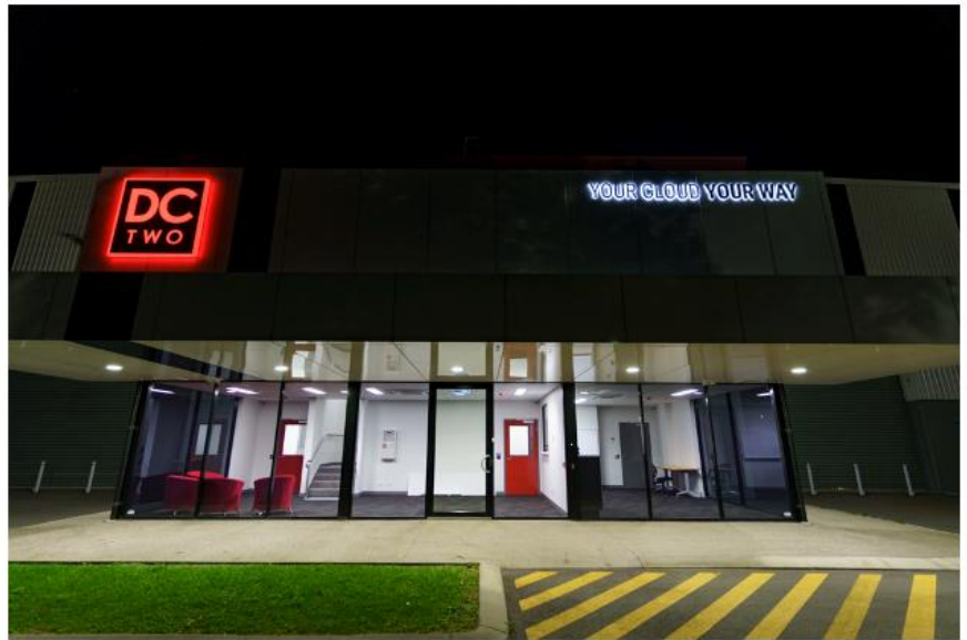
Above: Bibra Lake data centre now online in Stage 1 configuration