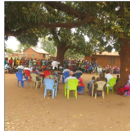
Village meeting July 2021