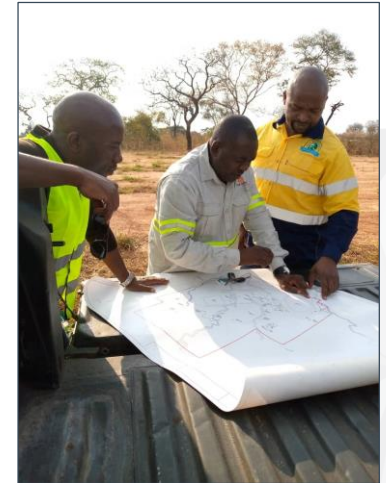
IPM Site visit August 2021