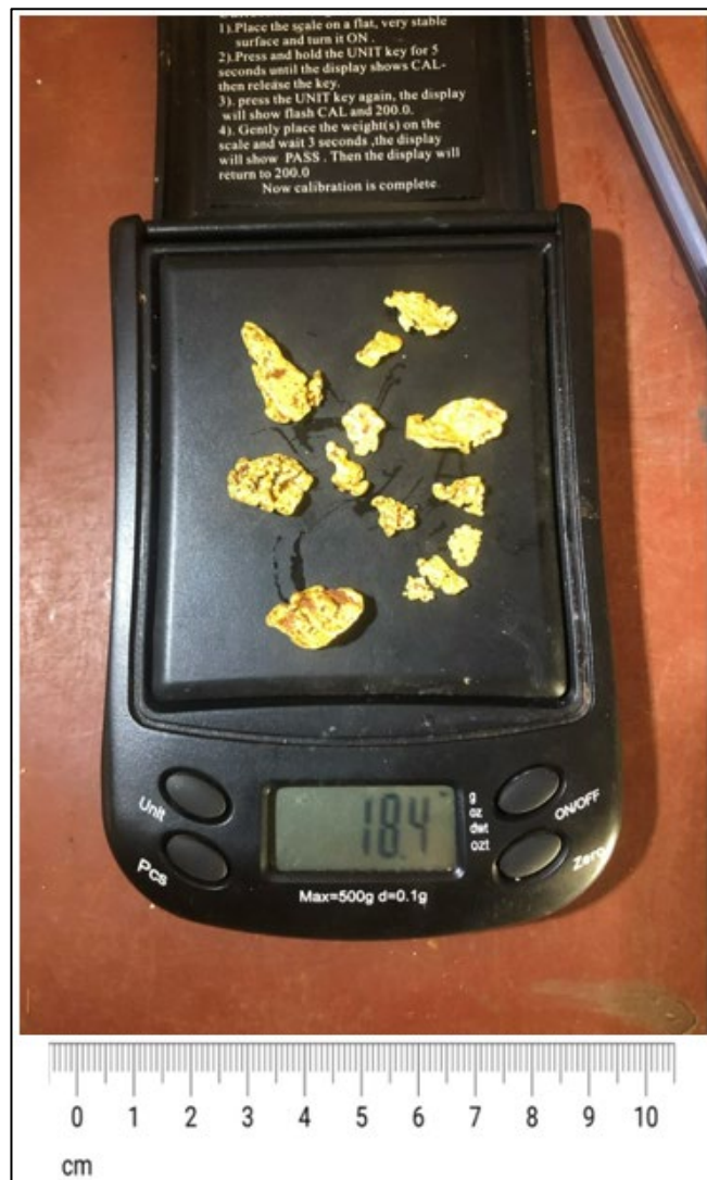
Figure 2. Alluvial gold recently recovered from tenement P25/2634