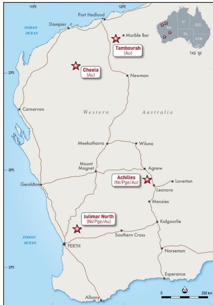
Figure 3. Tambourah Metals Project Locations

Tambourah Metals has consolidated the Tambourah Mineral field to enable systematic exploration for further high-grade Au occurrences. The company is also exploring for battery metals including Ni-PGE at Achilles (NE Goldfields) and Julimar NTH (Northern Wheatbelt). TMB is one of the largest tenement holders in the Julimar/Jimperding region. TMB listed on the Australian Security Exchange (August 2021) raising $8 million to carry exploration at the gold project at Tambourah Goldfield and Cheela Gold in the Pilbara. TMB is exploring for battery metals including Ni-PGE and Au at the Achilles project north of Laverton and the company has an extensive landholding at Julimar Nth where it has commenced exploration for Ni-PGE and Au.