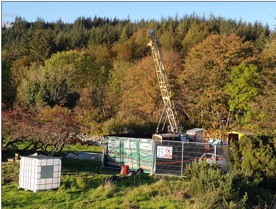
Figure 1: Photo of the drill rig set up on the first hole.

Planned drill holes between 150 and 300m in length will target mineralisation beneath the old workings (mined from surface commonly to a depth of approximately 45m). Holes will cover approximately 1km of strike extent of the potential 4.5km mineralised trend.