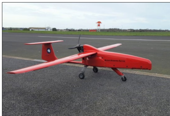
Figure 3: The Prion Mk3 drone used for the magnetic survey

The survey will be conducted by UAVE Ltd using the Prion Mk3 UAV, a purpose built fixed-wing drone with a nose mounted Geometric G-832A sensor, flown at approximately 100m above surface using a 200m x 500m survey grid spacing for more than 2,000 flown line kilometres.