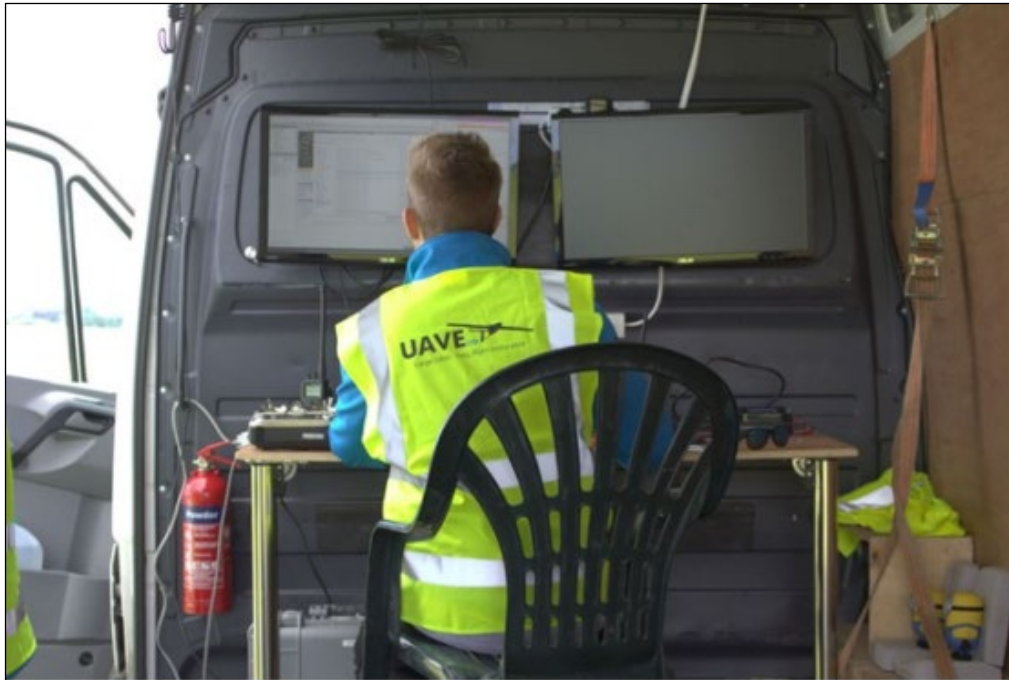
Figure 4: The UAVE team monitoring surveying from the mobile flight centre.

identified in the region. This will refine target areas of interest for ground exploration, underpinning the Company's objective of creating a "pipeline" of prospects to evaluate, and if warranted, advance towards initial drilling.