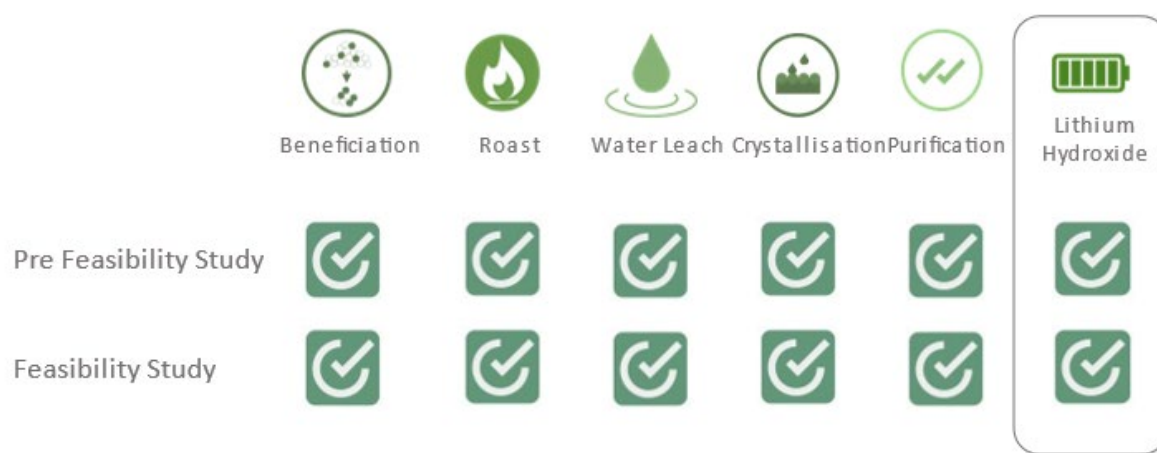
Figure 1: Summary of process flow sheet stages and current feasibility test work progress.

The product specifications are now available to facilitate the advancement of offtake discussions with automakers and lithium-ion battery producers including offtake partner LG Energy Solutions ('LGES') of South Korea (refer to ASX announcement 28 June 2021: Offtake MoU).