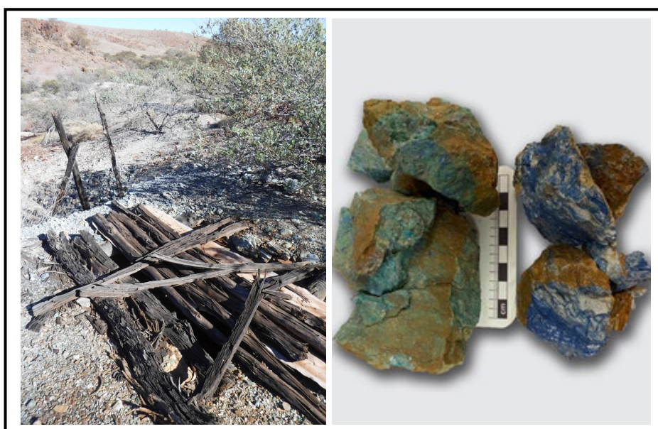
Figure 2: One of several historic copper workings from the 1960s in the project with oxide copper samples.

"The Company's Blue Rock Valley Project is an under explored and highly prospective mineral province, with the potential for high grade discoveries. This region has historic copper-lead-zin & copper working with rock chip samples to 16% Cu adjacent to the Talga shear zone. We are pleased that the survey has located late time bedrock conductors, especially combined with other influencing factors like geological control or geochemistry. We are looking forward to progressing these anomalies with ground EM surveys in the near future while we patiently await the return of the VTEM system to test our other highly desirable copper assets at Station Creek and Mt Boggola in four to five weeks".