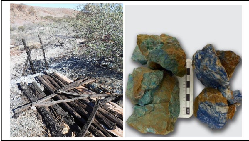
Figure 2: One of several historic copper workings from the 1960s in the project with oxide copper samples.

The Company looks forward to providing further updates across its 100% owned highly prospective copper-gold project portfolio in Western Australia.