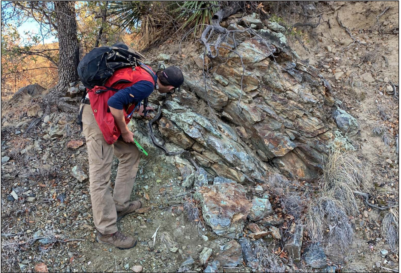
Figure 3 – Field mapping at OREX. Magnetite skarn with strong copper mineralisation (green) at the contact between Leatherwood and Escabrosa Formation (Sample C007032 527031E 3592944N)