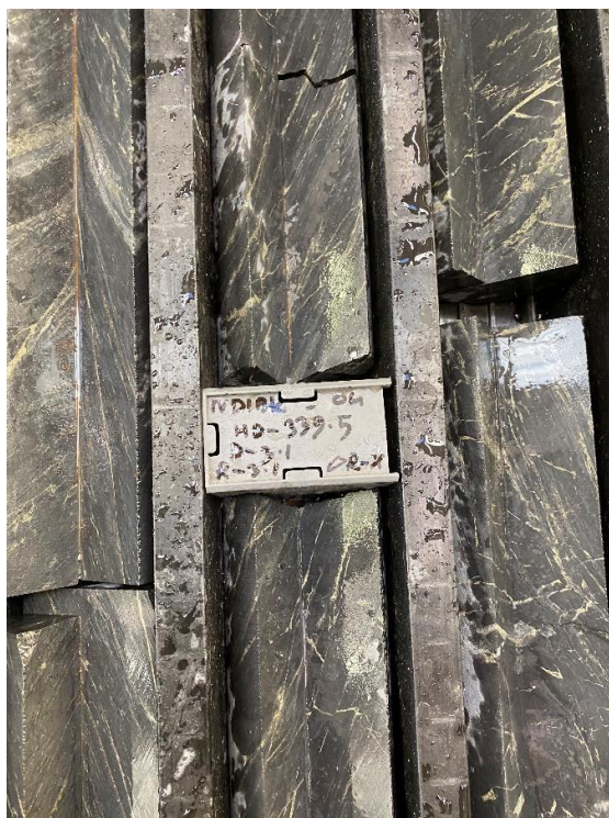
Figure 2 - Photo of core from Government drill-hole NDIBK04, core depth is 339.5m. The core has been cut in half and one half has been cut again. A quarter-core sample every metre has been submitted for multi-element analysis. THE CORE IN THIS PICTURE IS FROM GOVERNMENT DRILL HOLE NDIBK04 - IT IS NOT THE PROPERTY OF THE COMPANY - PENDING ASSAYS BEING CONDUCTED BY THE GOVERNMENT WILL BE PROVIDED TO THE PUBLIC VIA GOVERNMENT AGENCY WEBSITES

Government Drill Hole NDIBK04 drill hole parameters: