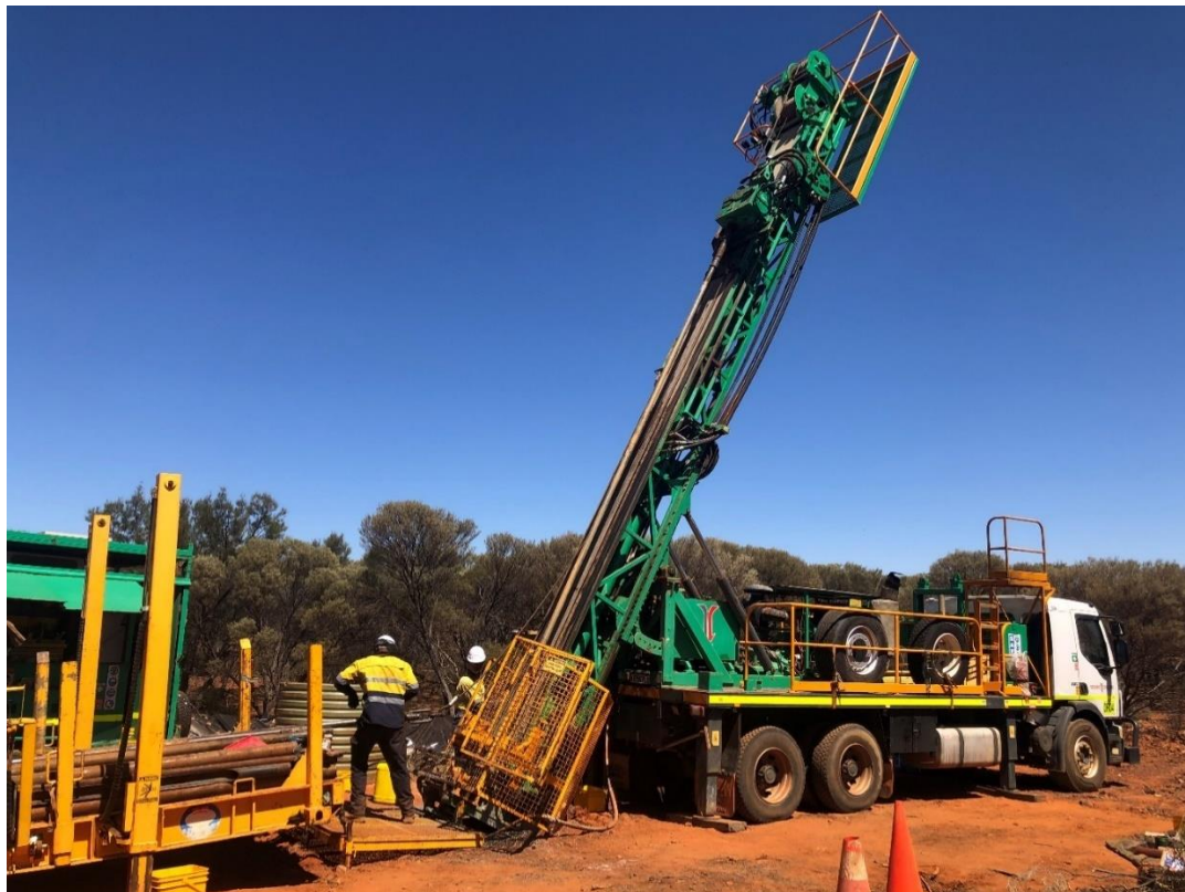
Photo 1 – Diamond drill rig commencing drill programme at the Leinster Nickel Project

Our maiden RC programme at Nepean has been completed, which tested both near-mine shallow drill targets as well as more regional greenfields targets along the full 10km of prospective strike. We are awaiting assay and DHEM results which we expect to receive over the coming weeks."