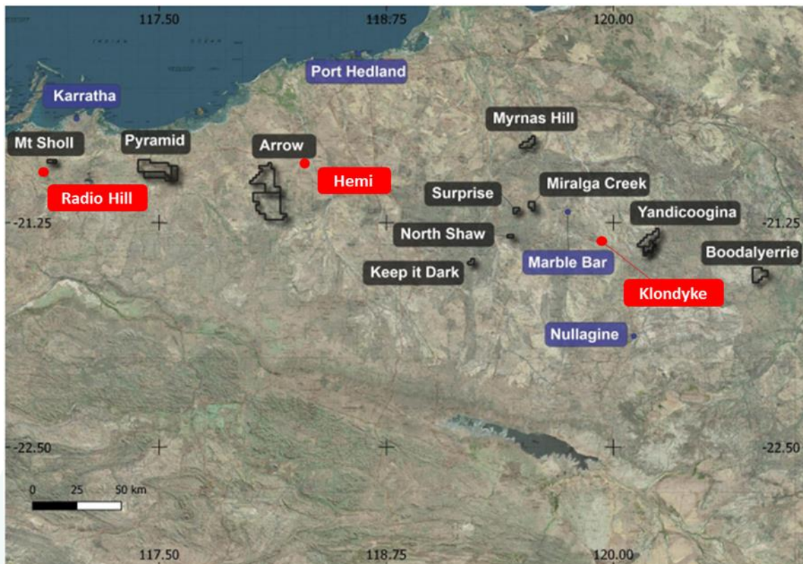
Figure 1: Pilbara property portfolio

Raiden Resources Limited (ASX: RDN) ("Raiden" or "the Company") is pleased to announce that an airborne magnetic survey has commenced over its flagship Arrow property in the Pilbara region of Western Australia.