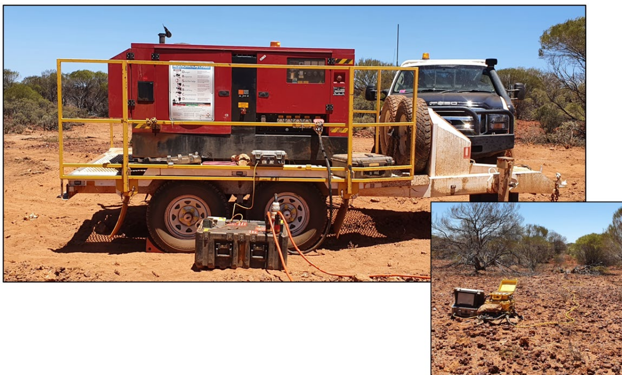
Figure 2. FLTEM transmitter equipment on site at Narndee. Inset, receiver loop capturing readings on one of the survey lines.

Geophysical contractors HPEM Geophysical Services have been mobilised to site and commenced surveying on 12 February 2021 (Figure 2).