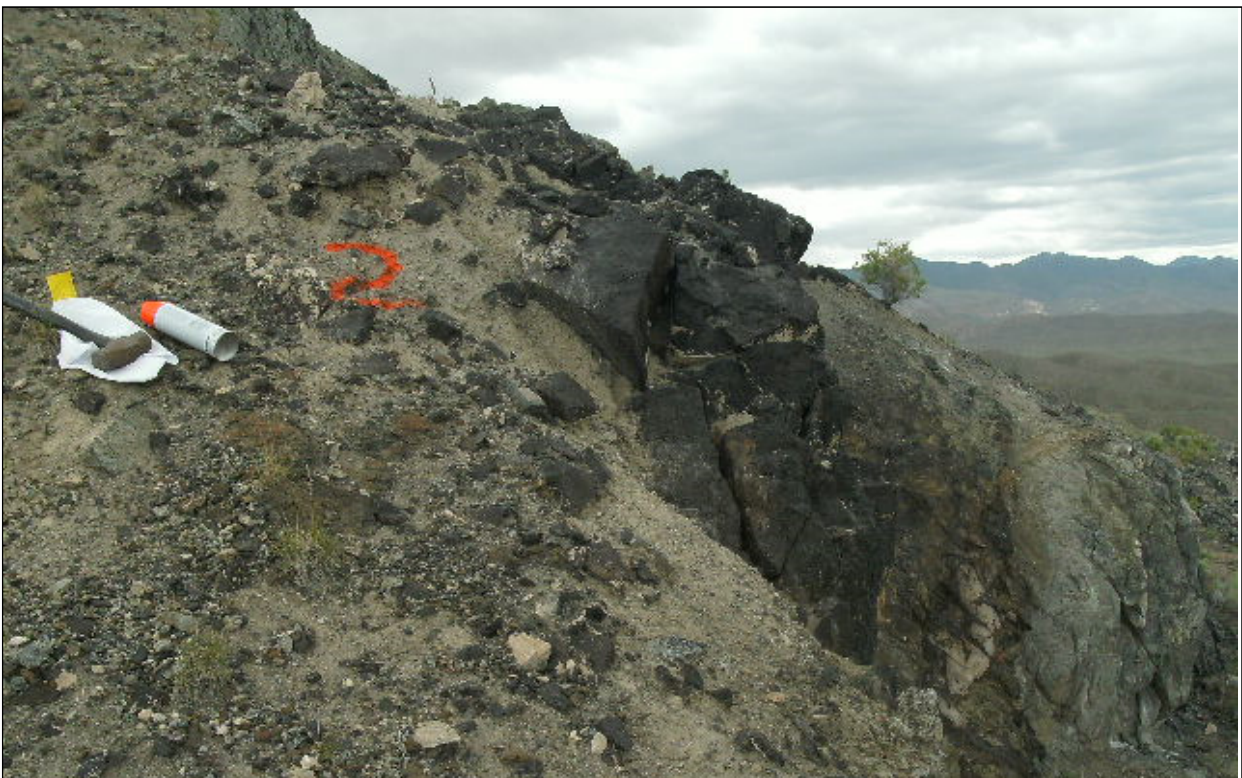
Iron Horse Prospect – IHV02 Sample Site (39° 58.592', 118° 09.665')

Geochemically, the Iron Horse rock chip assay results are very high grade. Such grades suggest strong potential for direct shipping ore ("DSO") and it therefore represents a high priority exploration target.