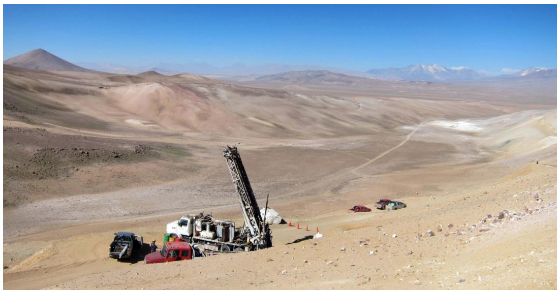
Figure 1: Drilling RCCP01 at Carachapampa, 2011

For more information, visit www.condormines.com or contact: