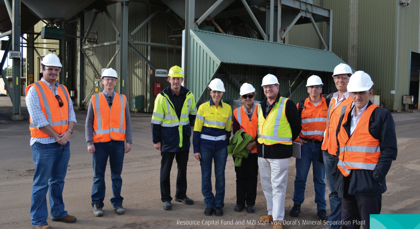
Resource Capital Fund and MZI staff visit Doral's Mineral Separation Plant

In the last quarter of FY 2014 and into the first quarter of FY 2015, management and staff have been working diligently to complete all of the commercial arrangements required to drawdown funds for the commencement of construction at Keysbrook and to modify and upgrade Doral's mineral separation plant at Picton. These arrangements include offtake agreements, construction contracts, a logistics agreement, mining and ancillary equipment sourcing and financing, further landowner agreements and some modifications to mining access agreements with landowners. Combined with financing documentation, the Company has been working on completing over 30 agreements with RCF, RMB and third parties.