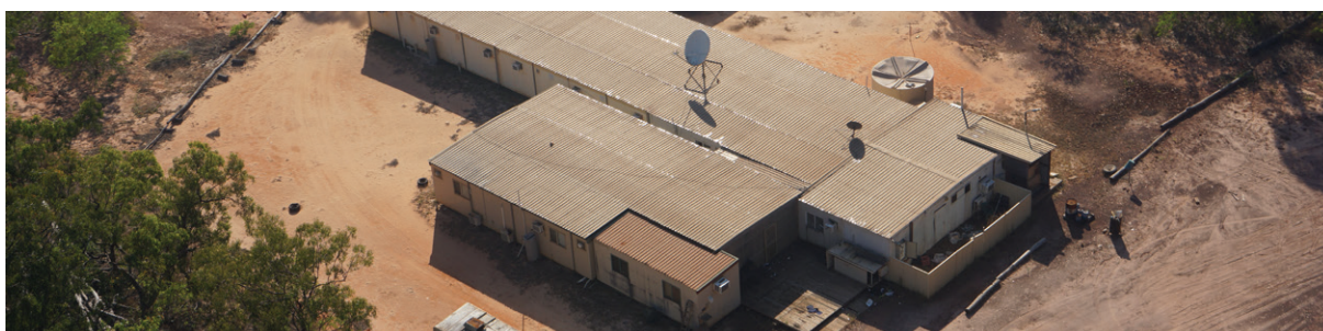
Accommodation units at Lethbridge South

from Lethbridge and off Melville Island to the Northern Territory mainland over the last half of 2014. Equipment not sold is planned to be removed from site by MZI over the same period. Much of the equipment removed by MZI including pumps, pipes and tools will be transported to be used on the Keysbrook mine site. The remaining equipment will be sold or scrapped in Darwin. As part of our ongoing commitment to the Tiwi community MZI will donate the accommodation units to the Pickertaramoor College.