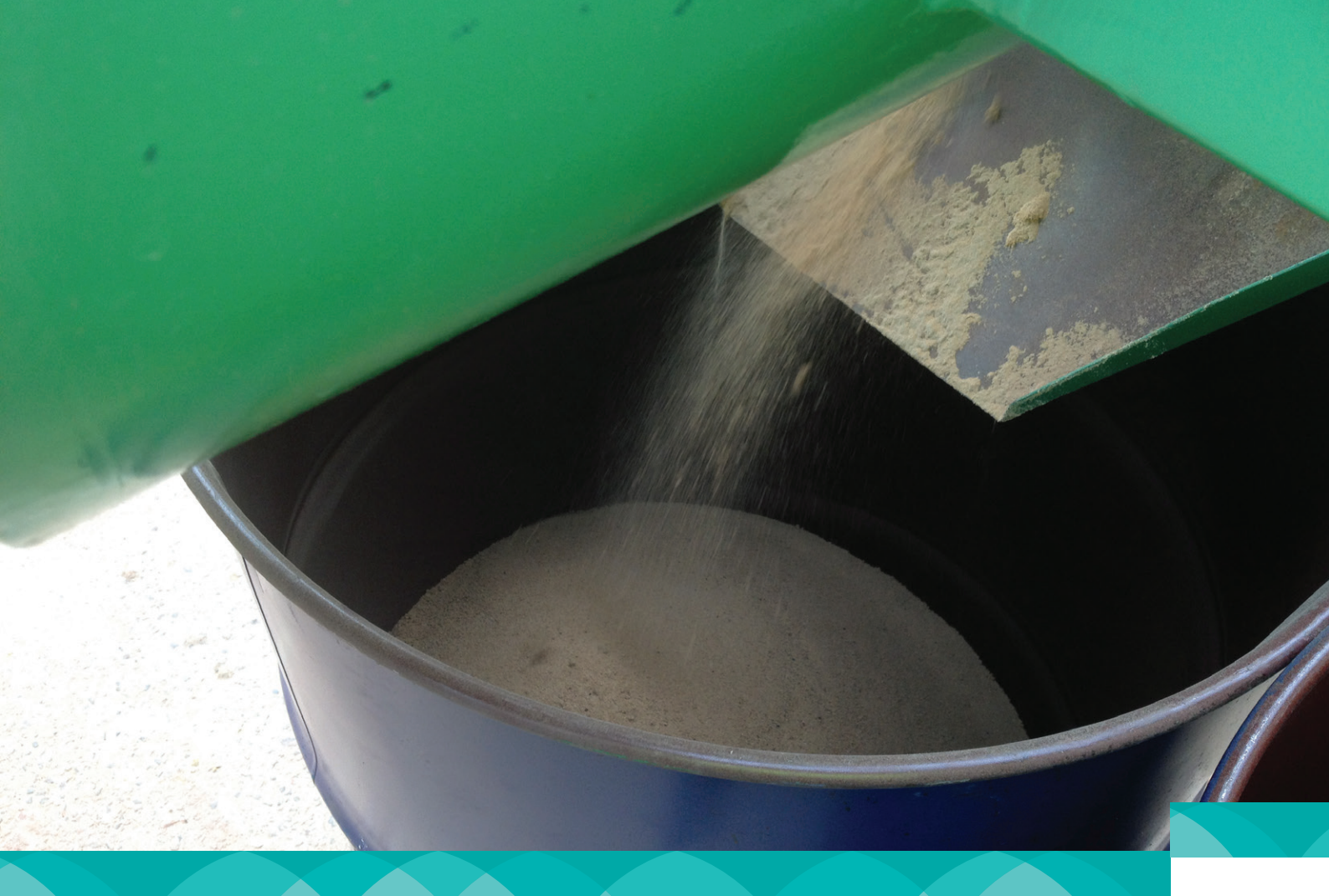
Table 1 - Keysbrook Mineral Resource and Assemblage Estimate