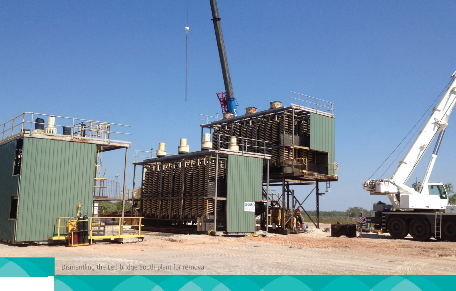
Dismantling the Lethbridge South plant for removal