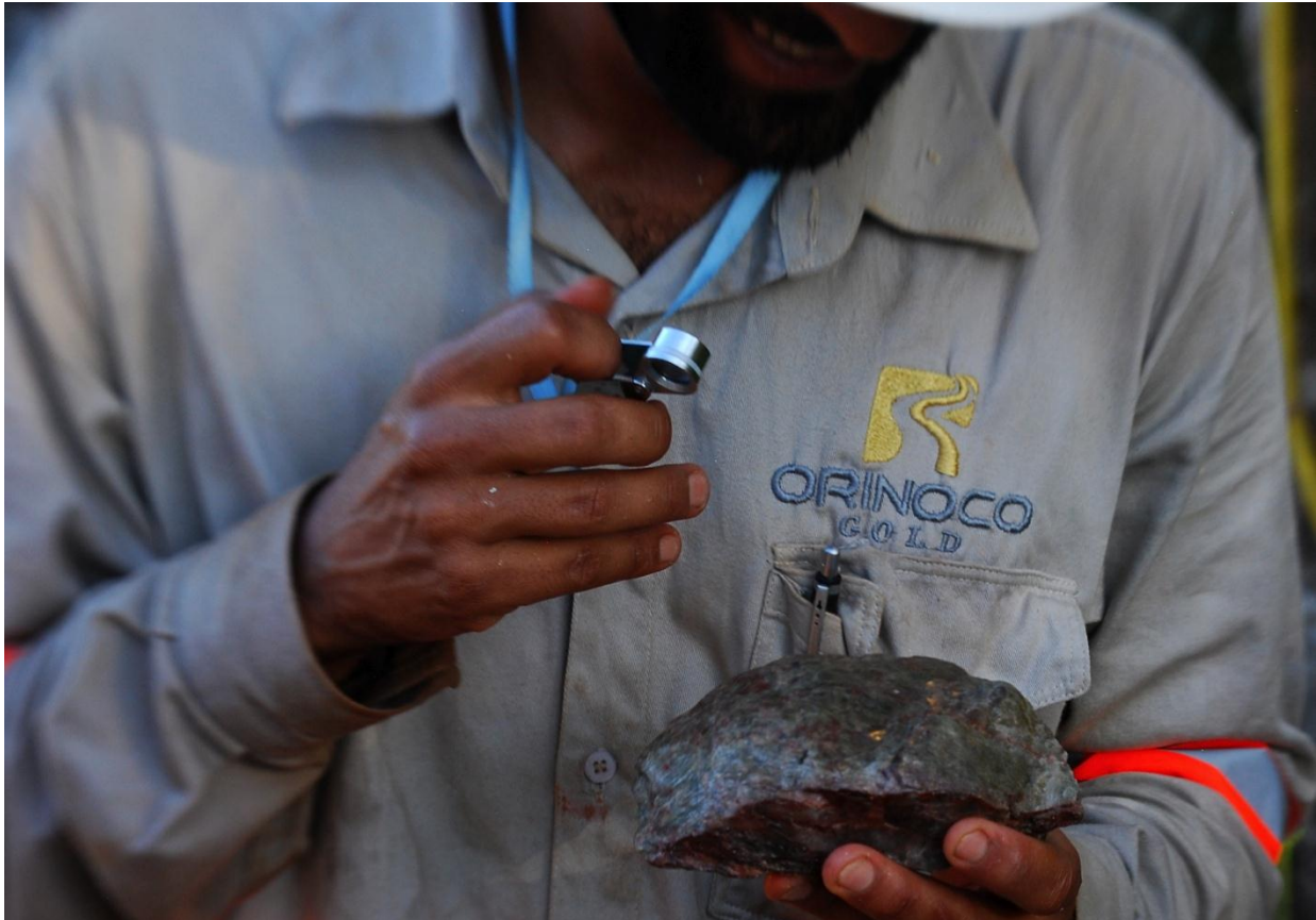
Figure 2. Orinoco geologist with a sample containing considerable visible gold taken from the latest advance at the Cascavel decline.

“This has positive implications not just for the future of Cascavel, but also for the prospectivity of the broader mineralised shear zone that makes up the +20km long corridor that extends from Cascavel to Sertão and which remains largely untested by drilling and bulk sampling,” he added.