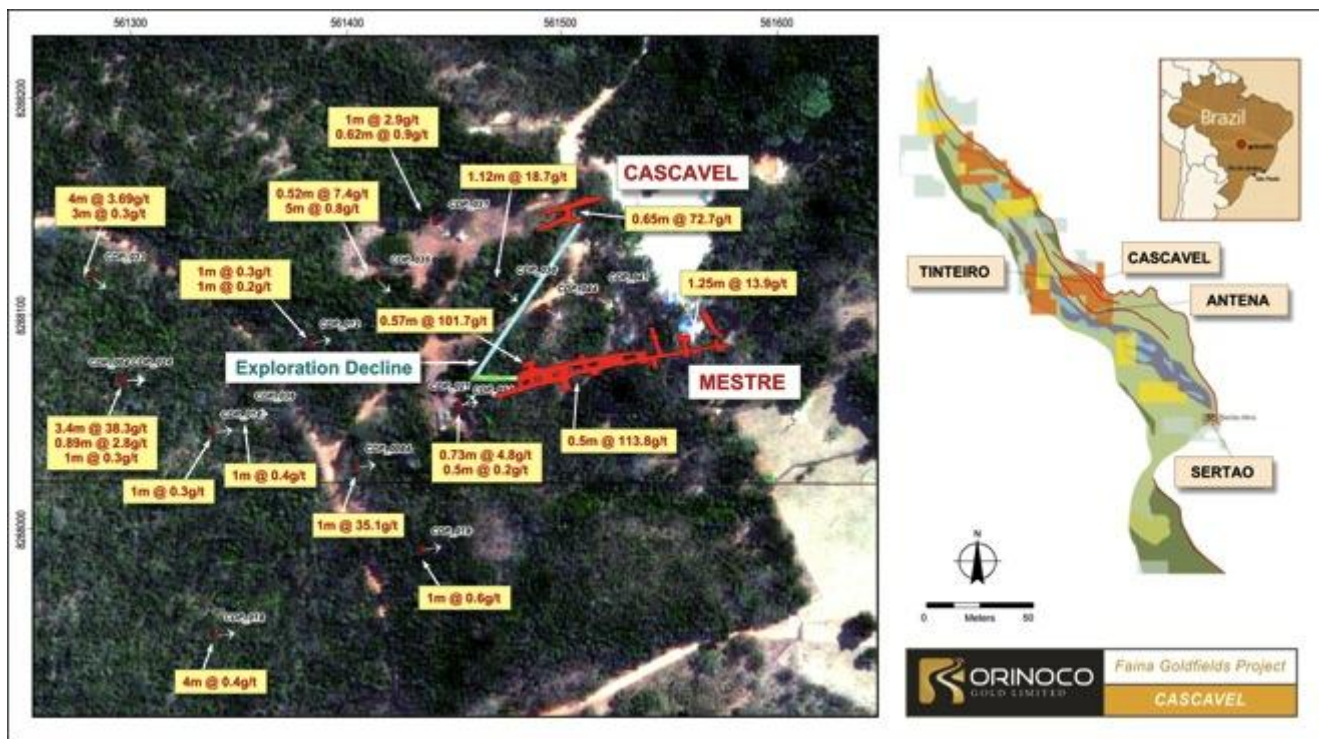
Figure 3. Location of Cascavel exploration decline. The proposed exploration decline (represented here in light blue) is a total of 90m in length.