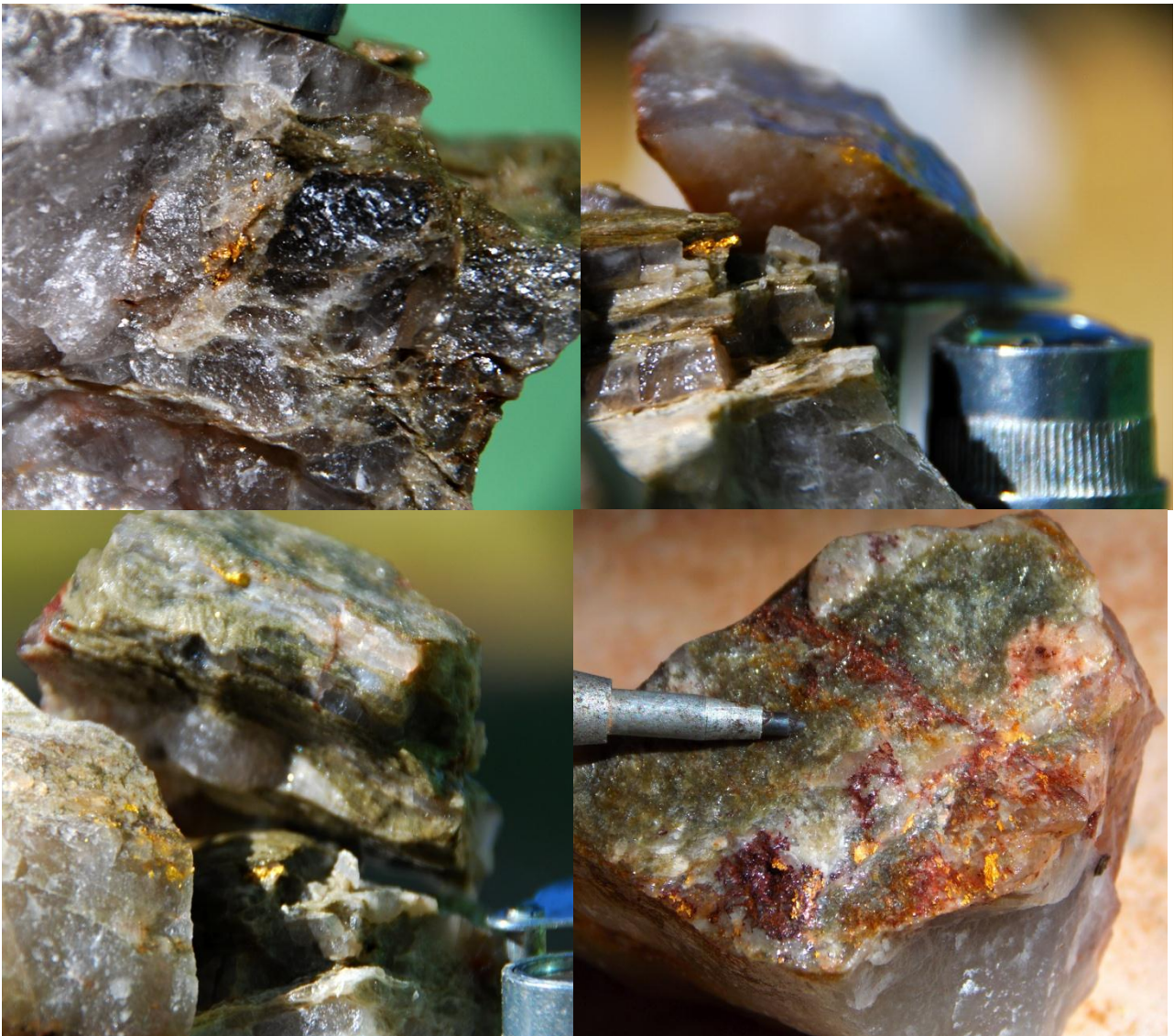
Figure 1. Visible gold from the area in the exploration decline immediately adjacent to the results contained in this announcement.

Orinoco continues to develop the exploration decline at Cascavel to further delineate additional high-grade shoots and assist in the planning of resource definition drilling. The exploration decline is designed to test the mineralised zone along strike and down dip and is programmed to reach the high grade zone at the end of the Mestre winze (bulk sample reported 12 November 2012).