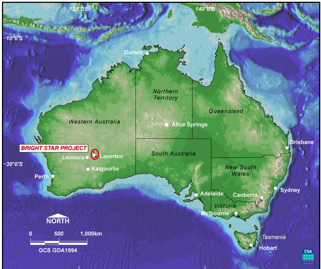
Diagram 1. Map showing proximity of Brightstar Project Area