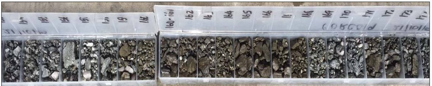
Photo 1: RC Chip samples from CORC019 showing high grade zone from 153m – 174m