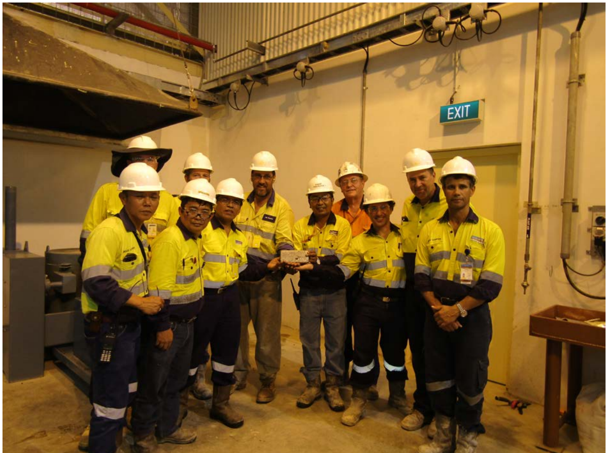
Tembang Operations team with first gold bar