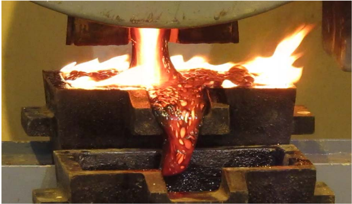
Maiden gold pour at Tembang